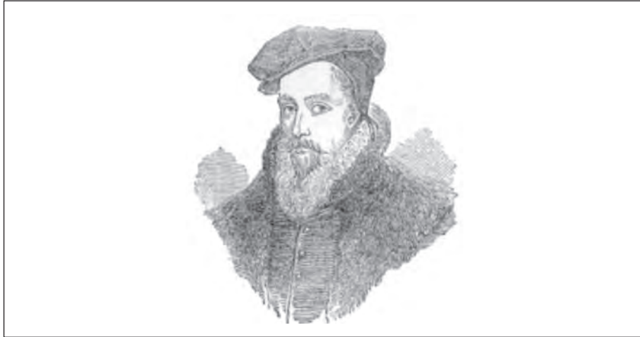
[The illustration shows William Cecil (Lord Burleigh), an important Elizabethan courtier and politician]

Study the source below and answer the questions which follow.