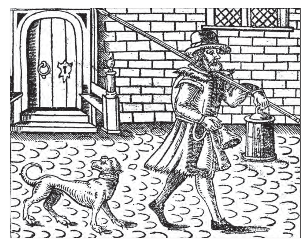
[A Tudor watchman on patrol at night]