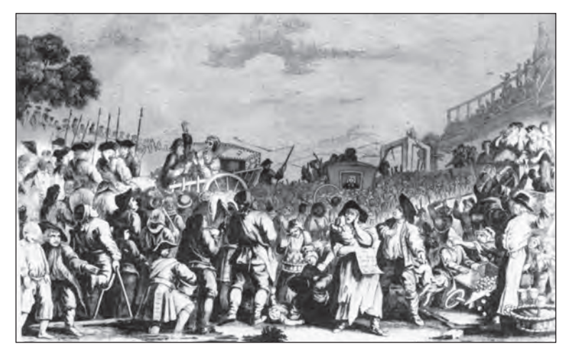
[A huge crowd gathered to watch a public execution at Tyburn in 1747]