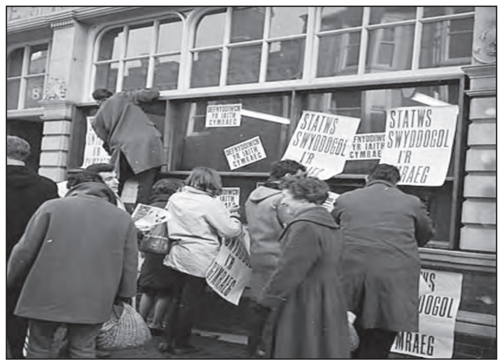
[Members of Cymdeithas yr Iaith Gymraeg (Welsh Language Society) protesting for official status for the Welsh language in 1963]