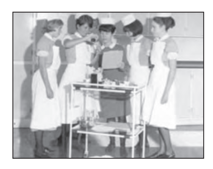
[Trainee nurses in the new National Health Service established in 1948]