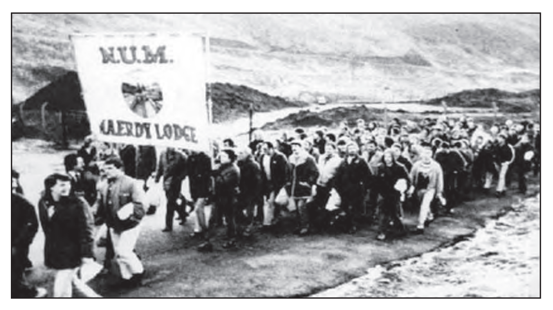
[Miners from Maerdy Colliery returning to work after the Miners' Strike in 1985. The colliery closed a few years later.]