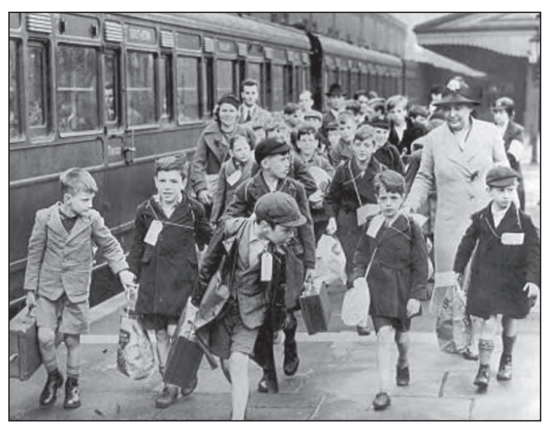
[Evacuees from London arriving in South Wales in September 1939]