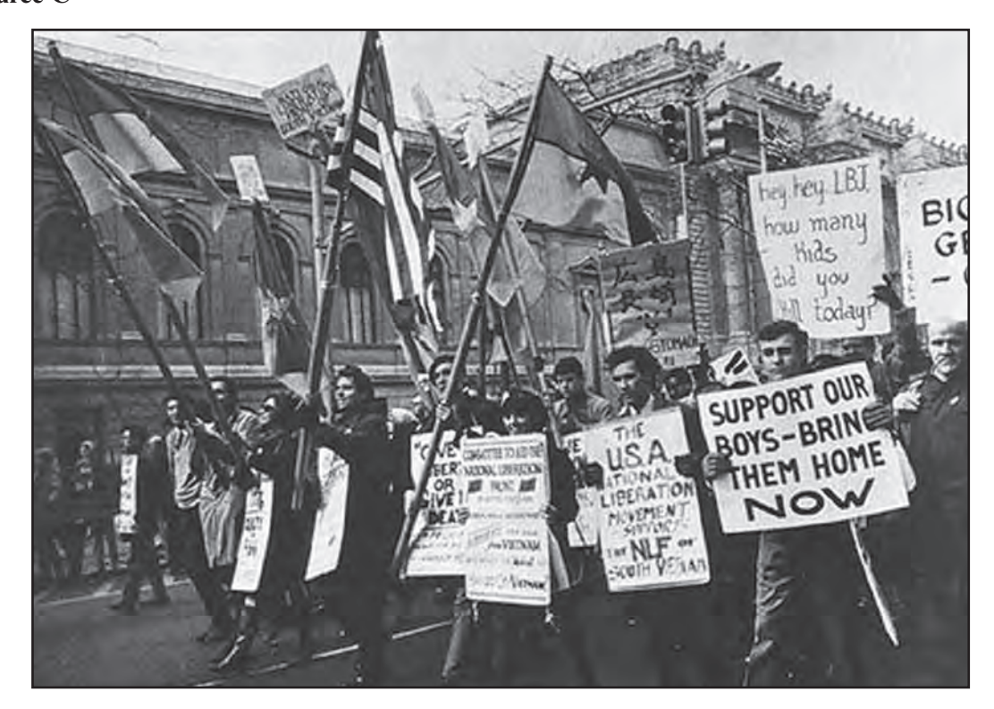
[A photograph of student protesters in the USA in 1969]