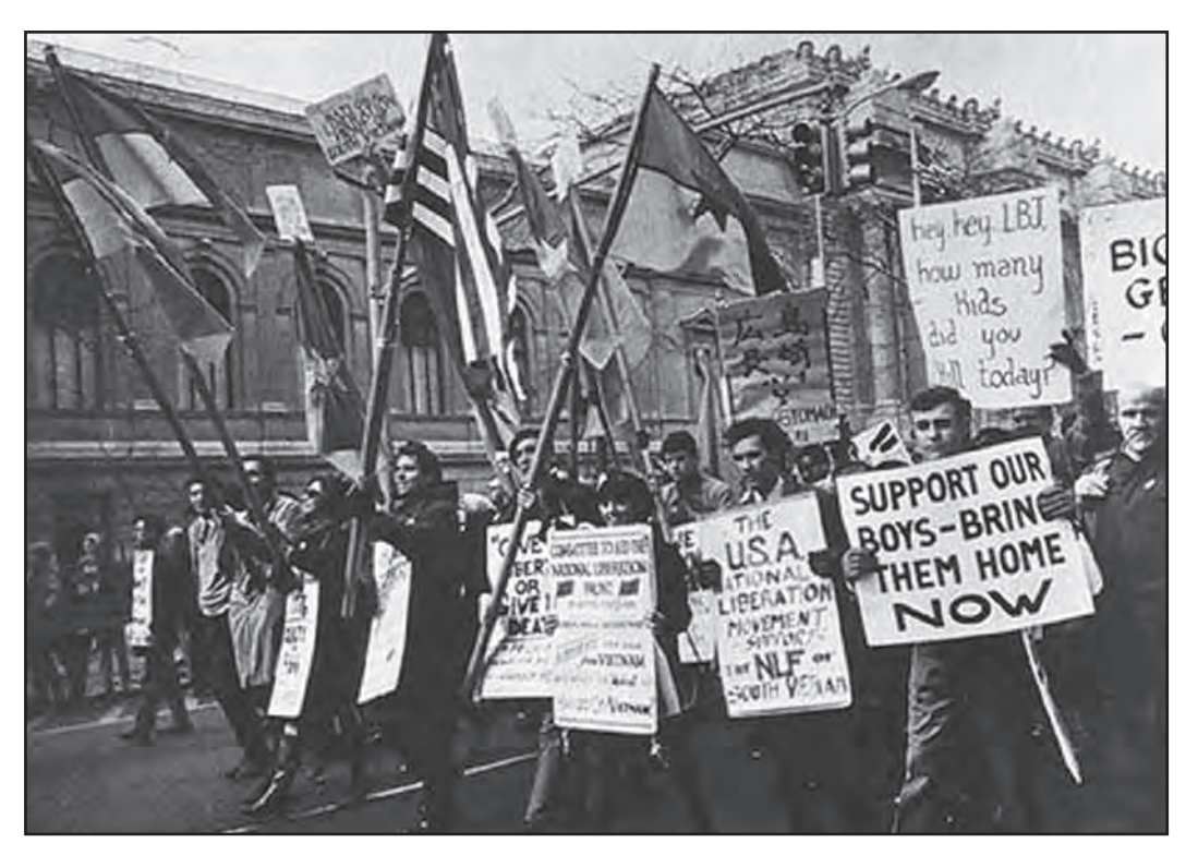
[A photograph of student protesters in the USA in 1969]