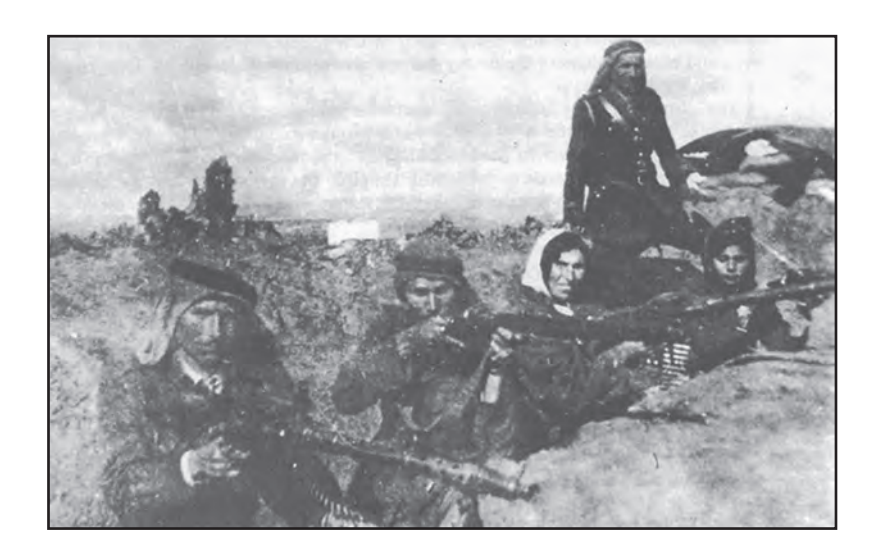
[A picture of the Arab Revolt in the late 1930s]