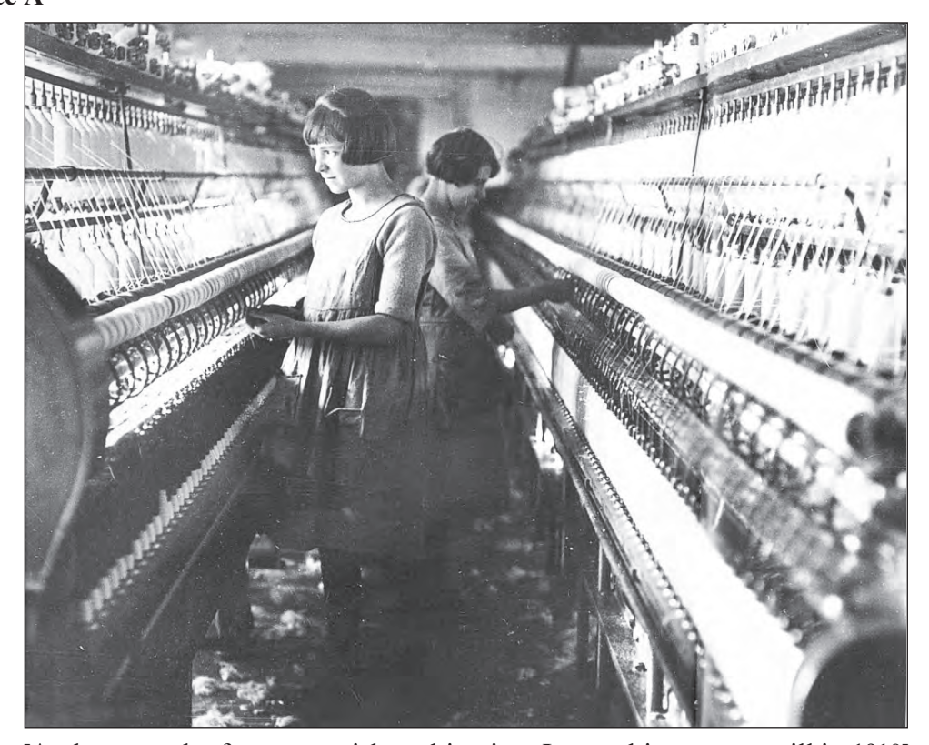
[A photograph of a young girl working in a Lancashire cotton mill in 1910]

This question is an enquiry into the changing nature of women's work and employment. [25] Study the sources below and then answer the questions which follow each source. Source A