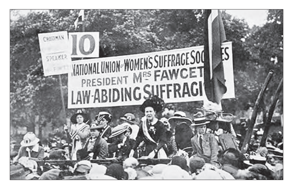
[A photograph of a National Union of Women's Suffrage Society rally at Hyde Park, London, in 1913]

Study the photograph below and then answer the questions which follow.