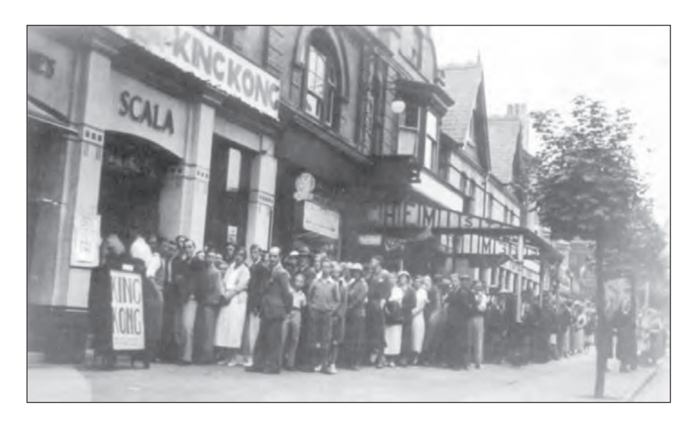
[A photograph of the Scala Cinema at Prestatyn, North Wales, in 1938]

Study the photograph below and then answer the questions which follow.