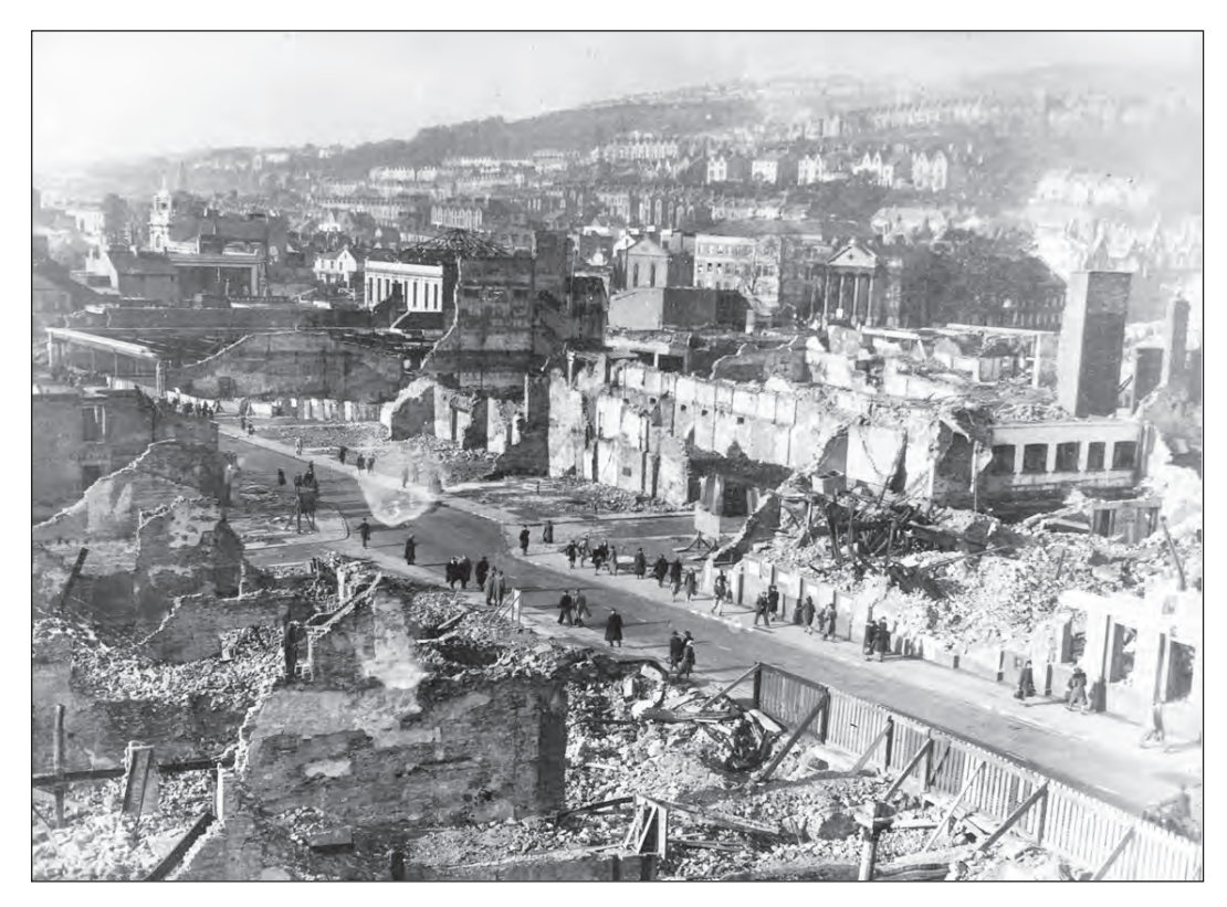
[A photograph of Swansea city centre in 1948 after the end of the Second World War, showing the damage caused by the Blitz]

Study the photograph below and then answer the questions which follow.