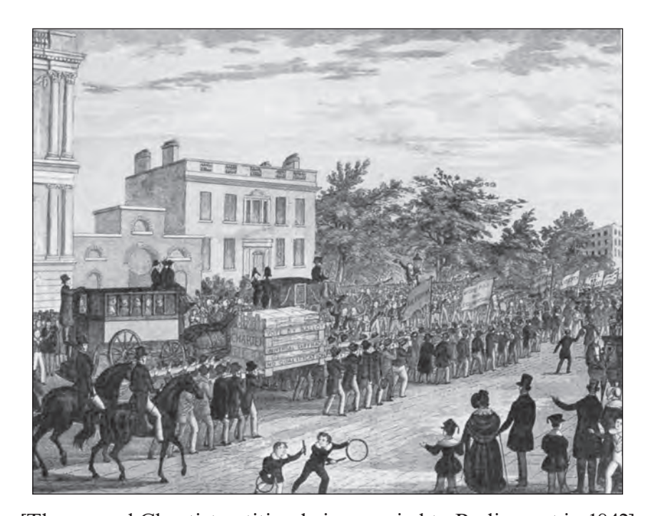
[The second Chartist petition being carried to Parliament in 1842]