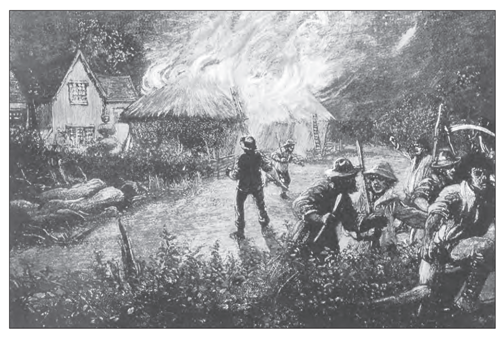
[A picture of Swing rioters setting fire to a hayrick in 1830]

Study the picture below and then answer the questions which follow.