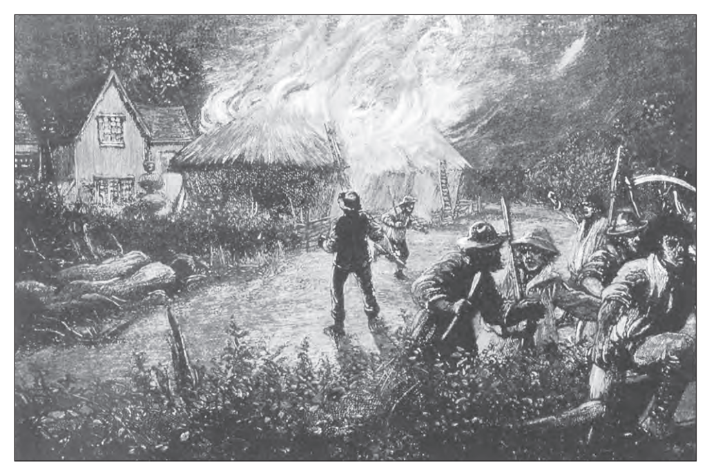
[A picture of Swing rioters setting fire to a hayrick in 1830]

Study the picture below. Answer the questions which follow.