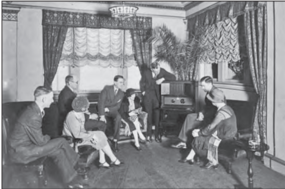
[A photograph of a group of Americans listening to the radio in the late 1920s]

Study the photograph below. Answer the questions which follow.