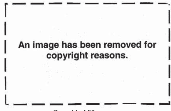
Page 11 of 66

Tanks were created by Lancelot de Mole. Tanks were capable of going behind enemy lines easily because they could withstand small arms fire and shrapnel. The tracks were good for going over muddy land like no man's land and could even withstand barbed wire.