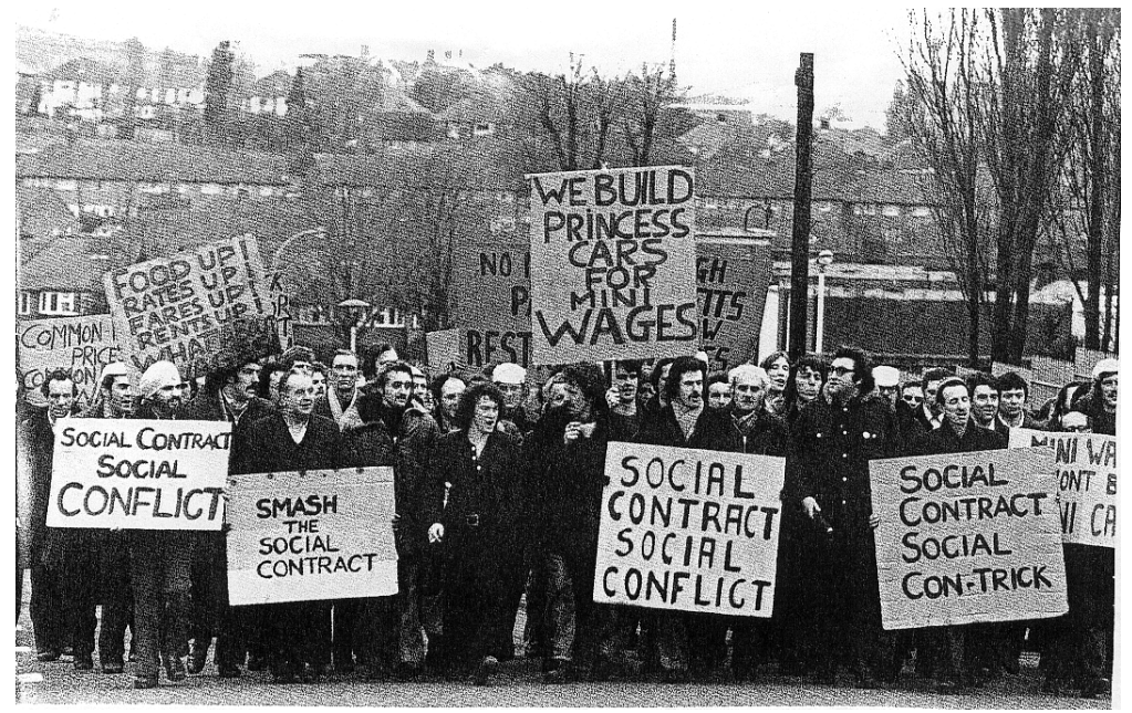
Leyland workers marching in protest at the Social Contract, 1977