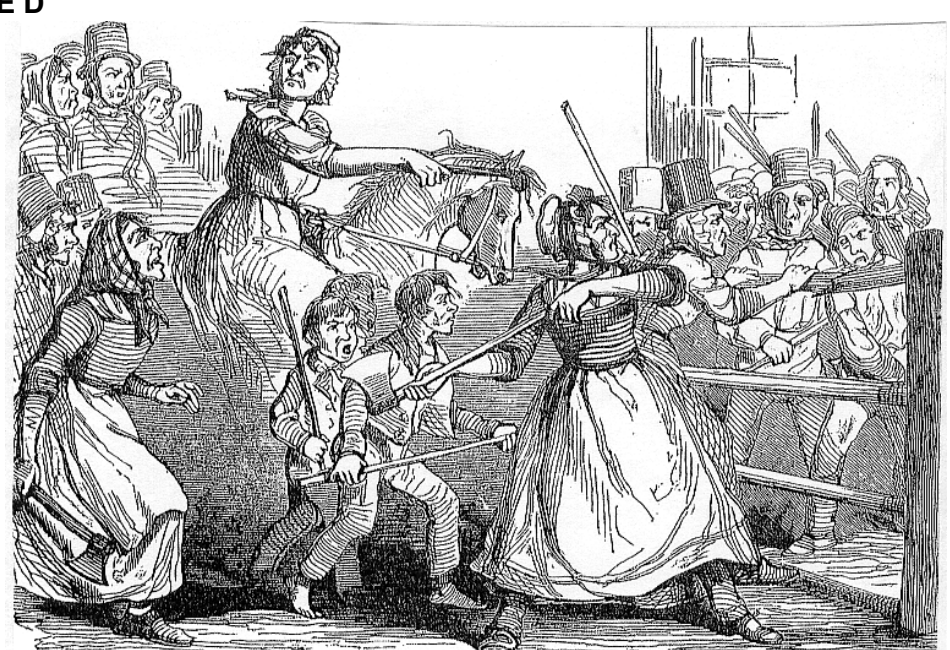
A contemporary cartoon of the Rebecca Rioters.