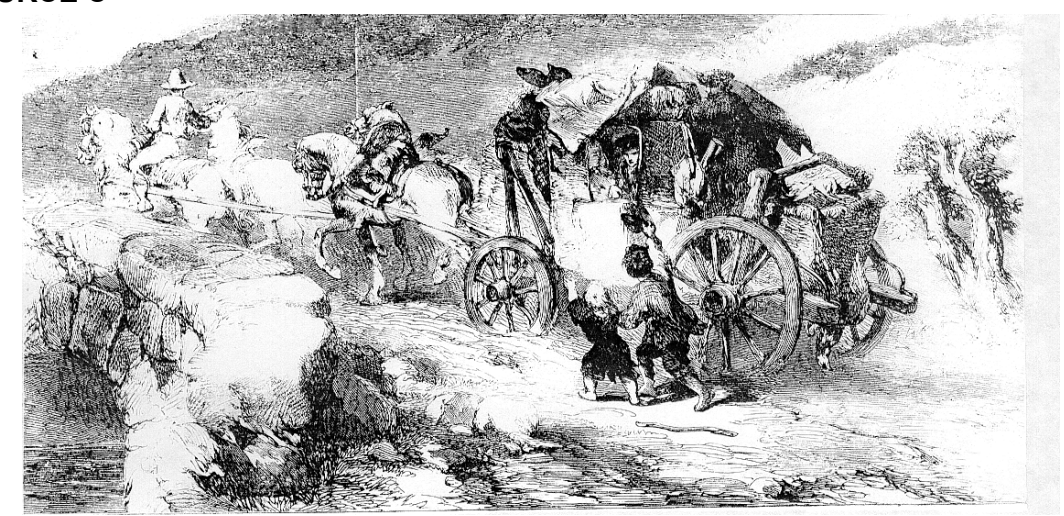
A painting showing coach travel in the eighteenth century.