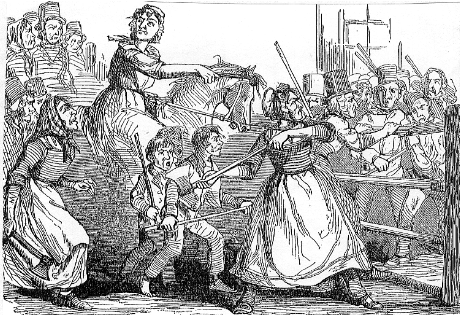
A contemporary cartoon of the Rebecca Riots.