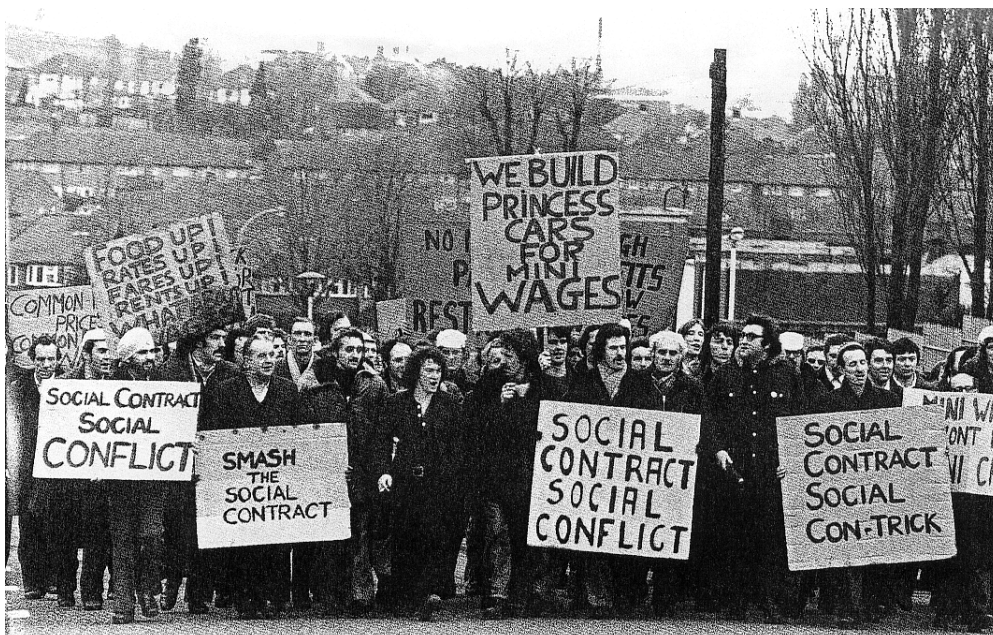
Leyland workers marching in protest at the Social Contract, 1977