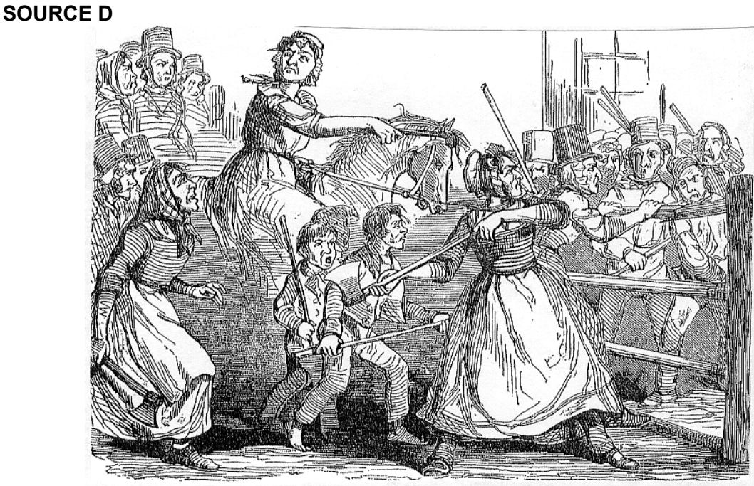
A contemporary cartoon of the Rebecca Rioters.