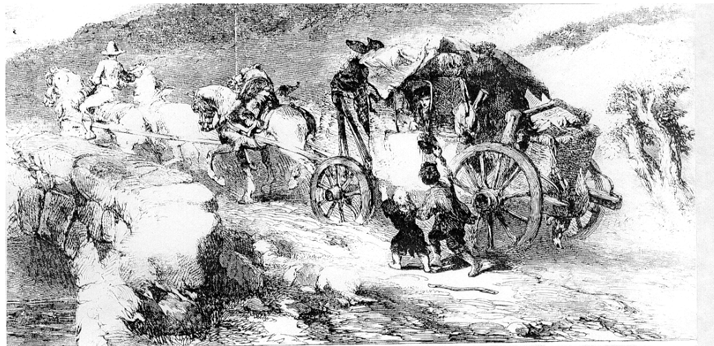
A painting showing coach travel in the eighteenth century.