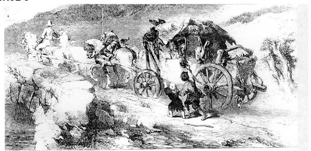
A painting showing coach travel in the eighteenth century.