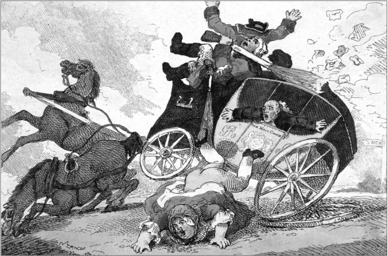
An eighteenth-century cartoon about road travel.