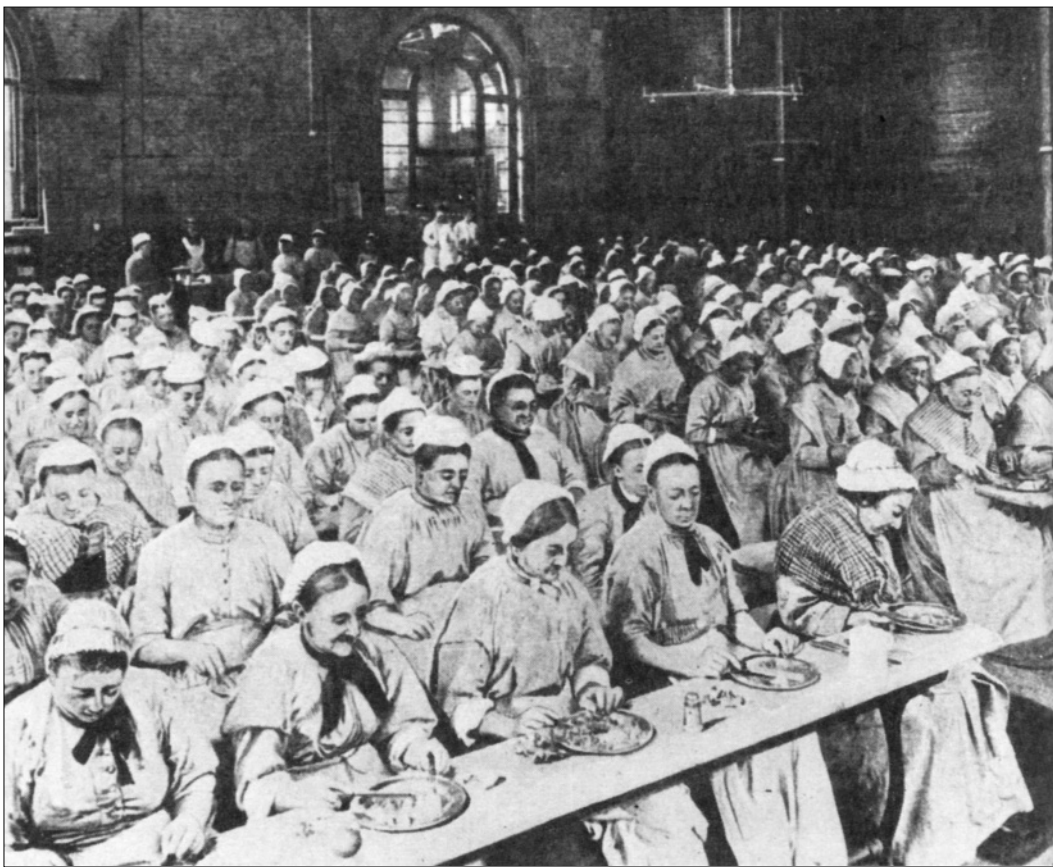
A photograph of dinner-time in a workhouse about 1900.