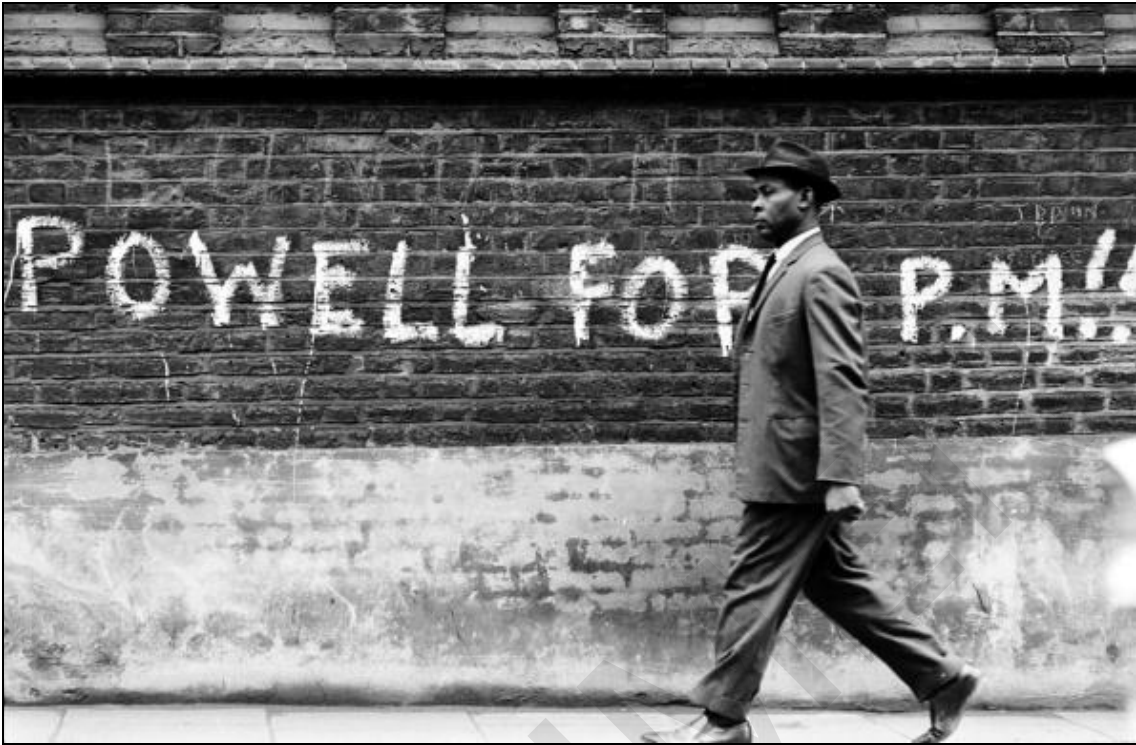
A photograph published in a London newspaper in May 1968. (‘P.M.’ refers to the position of Prime Minister.)