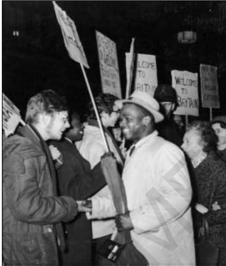
A photograph taken by a journalist of West Indian immigrants arriving at London's Waterloo Station in December 1961.