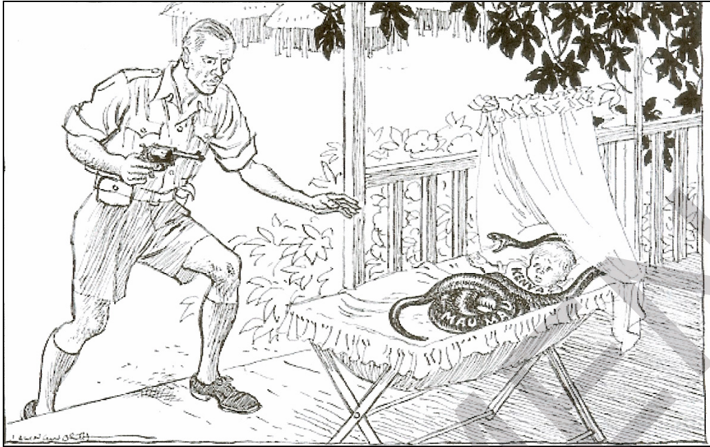
A British cartoon published on 22 October 1952, the day after British troops flew into Nairobi.