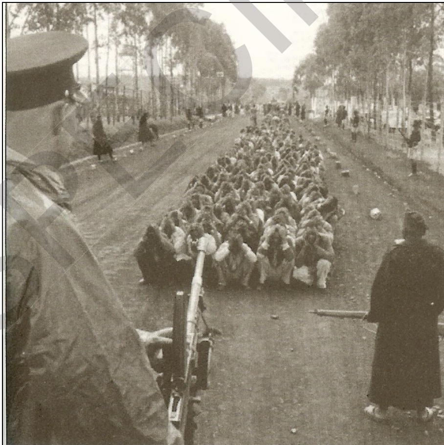
Suspected Mau Mau terrorists being rounded up in Kenya.