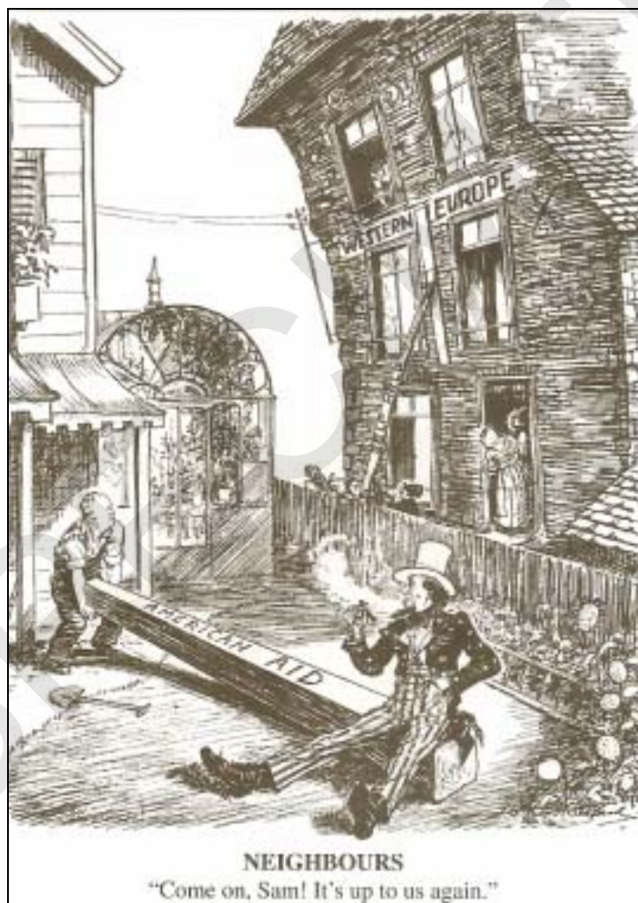
An American cartoon about the Marshall plan, published in 1947.