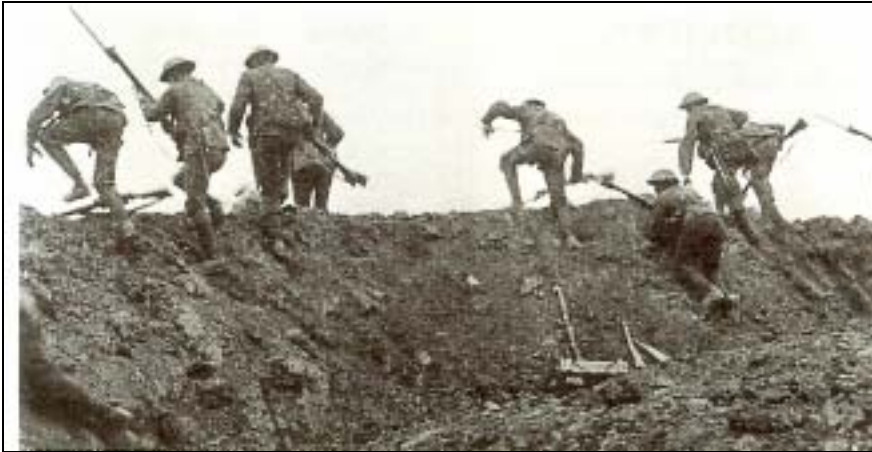
A still picture from a silent film produced by the British government in 1916. The film was first shown in cinemas around the country in August 1916.