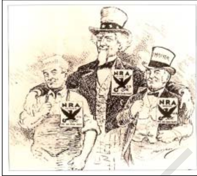
An American cartoon published in 1933.