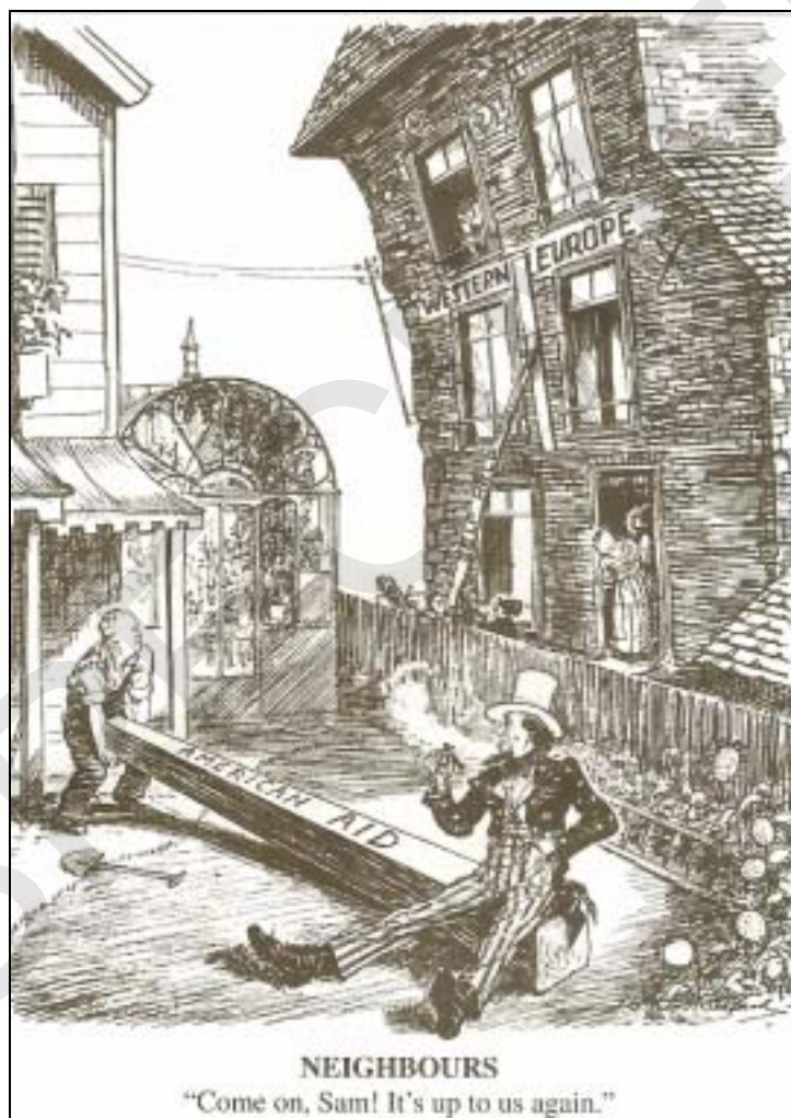
An American cartoon about the Marshall plan, published in 1947.