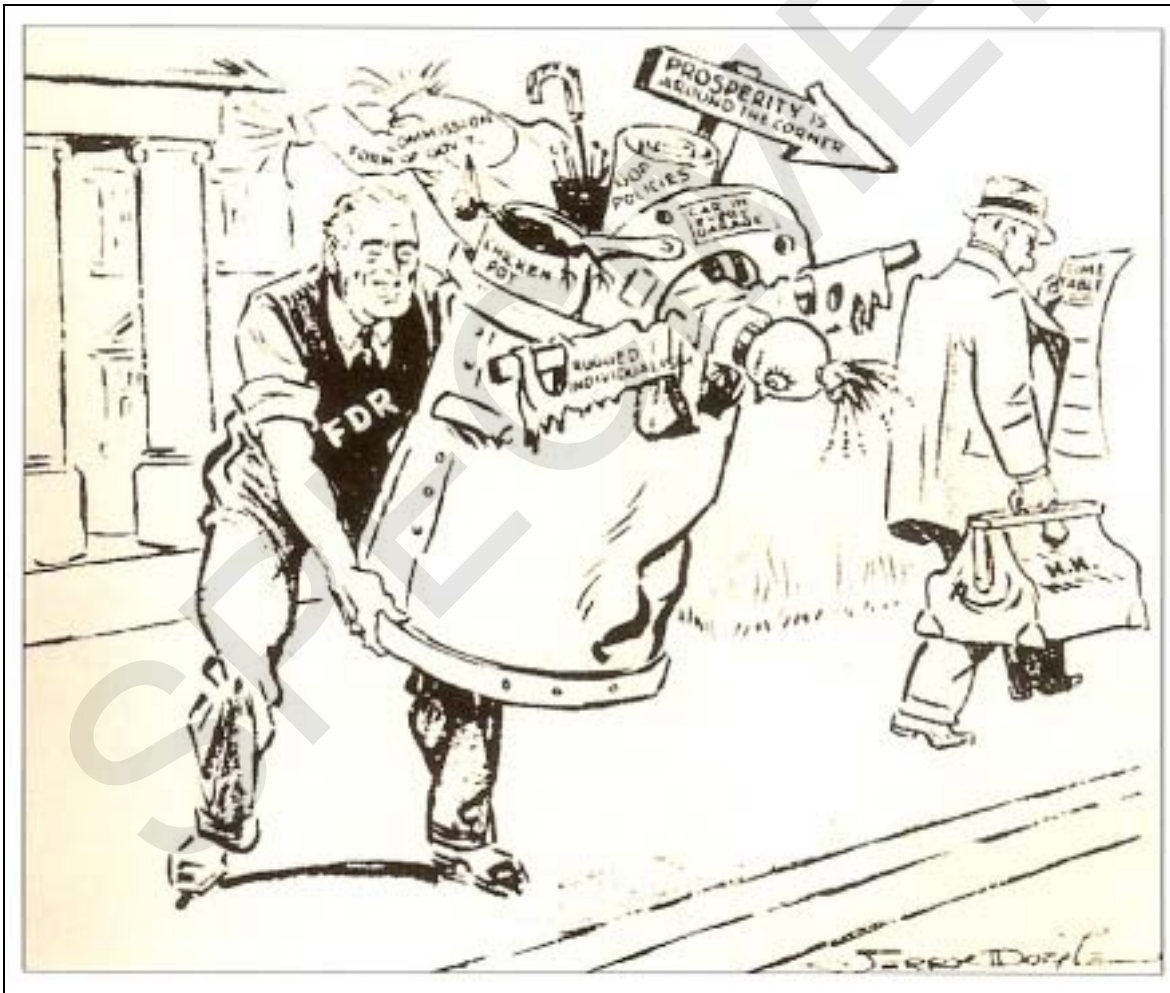
An American cartoon published in 1933. The two men are Roosevelt and Hoover.