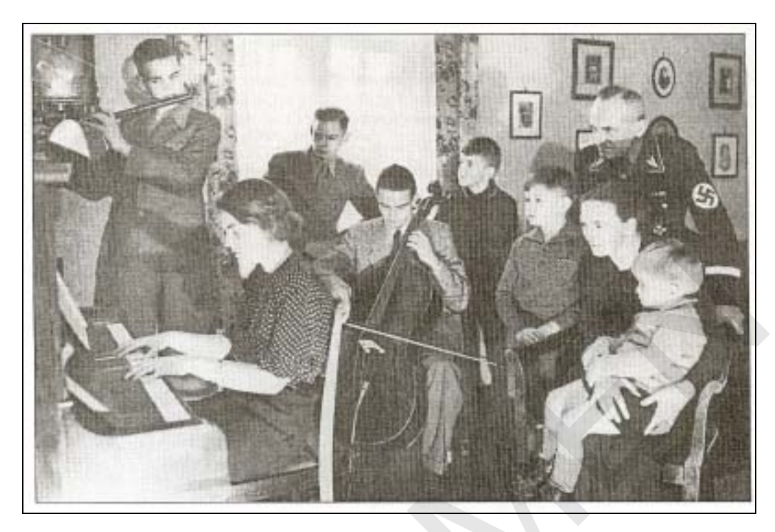
A photograph of a German family published in Germany in the late 1930s.