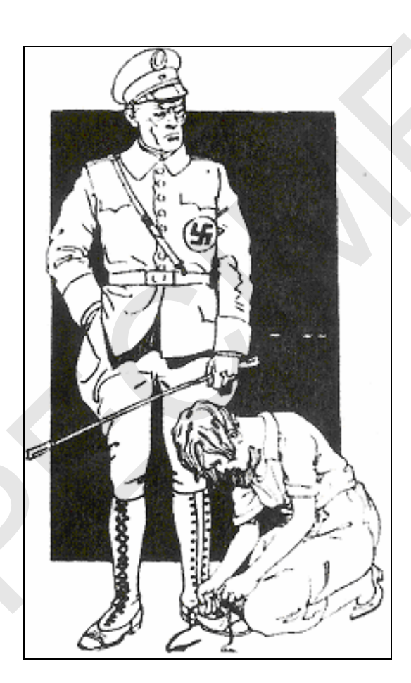
A Social Democrat poster published in 1931. It suggests what life will be like for women under the Nazis.