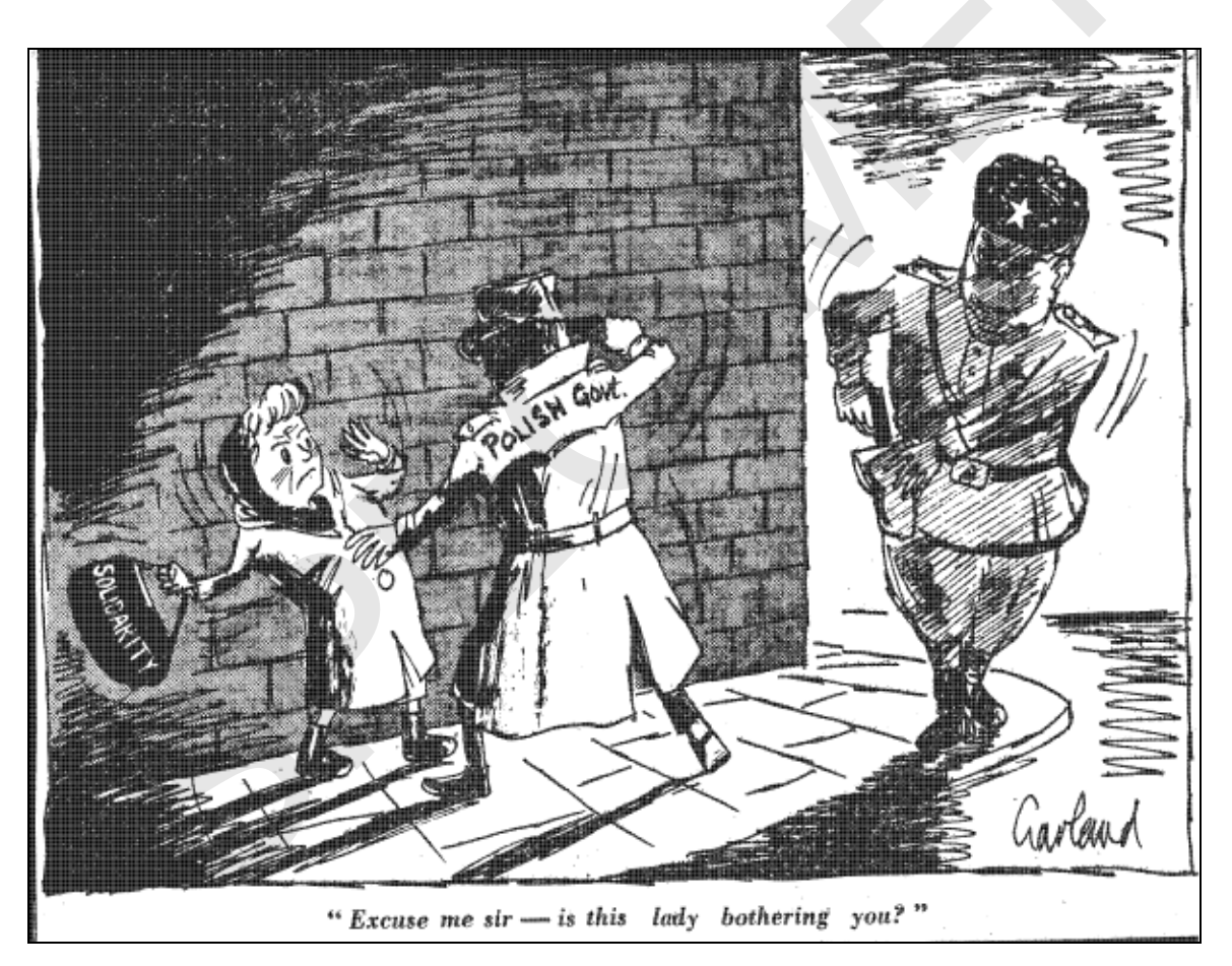
A cartoon published in an English newspaper, December 1980.