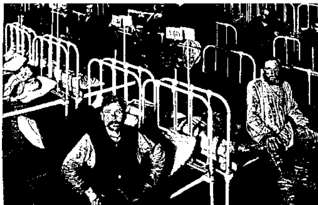
A photograph showing workers in a St. Petersburg dormitory in 1900.