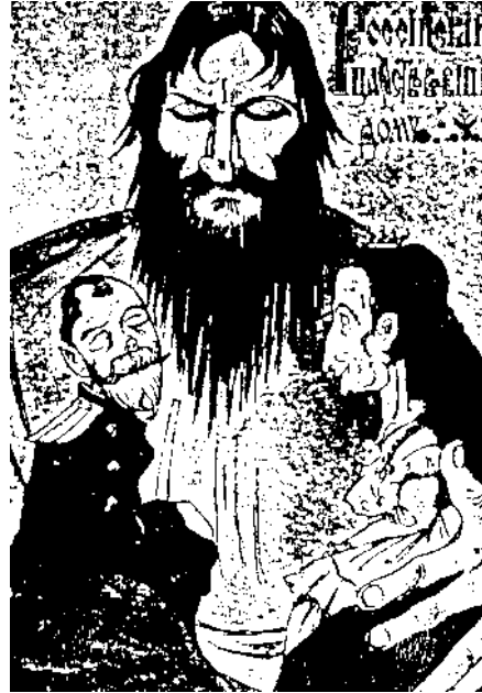
The caption reads: 'THE RUSSIAN TSARS AT HOME.'

A Russian cartoon showing Nicholas II, Alexandra and Rasputin.