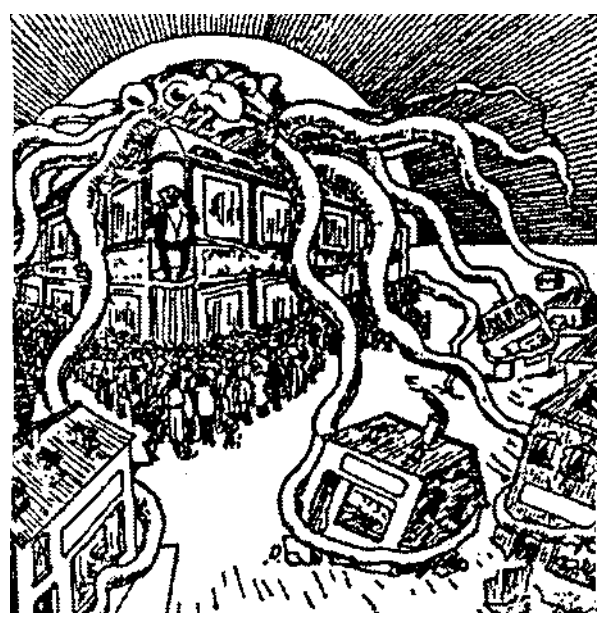
A cartoon published around 1930. The cartoon was entitled 'The Jewish department store eats up German shopkeepers'.