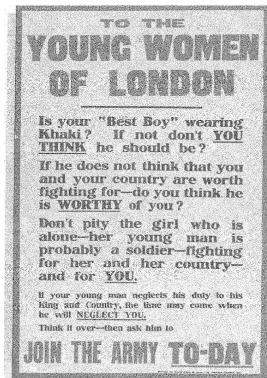
A British poster 1915