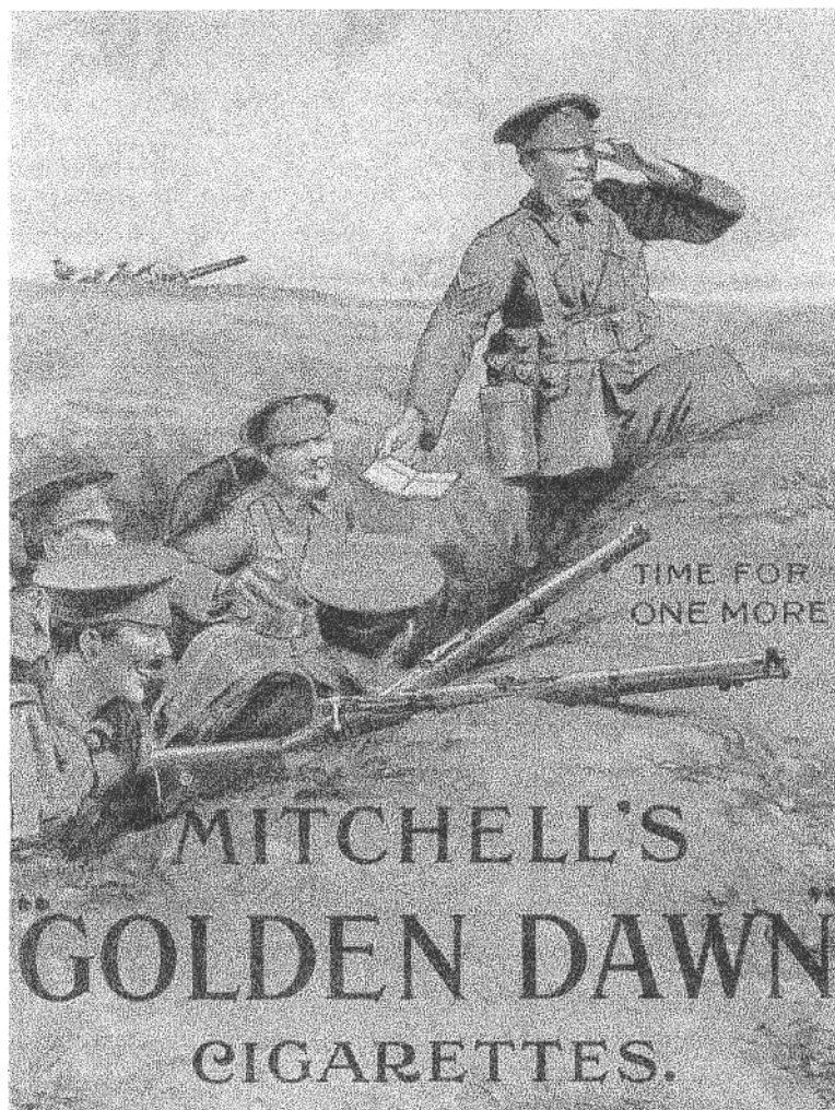
A British advertising poster, 1915.