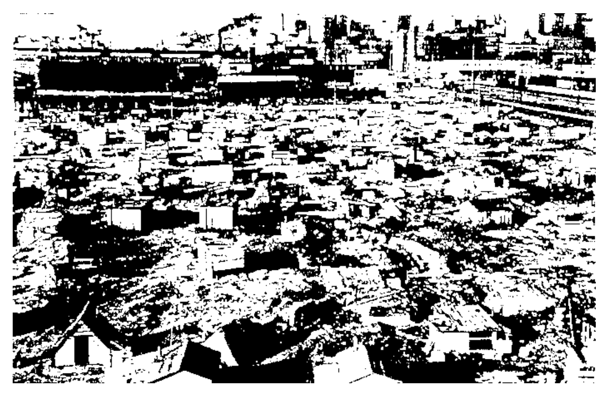
A photograph of a shanty town on wasteland in Seattle, Washington taken in 1931.