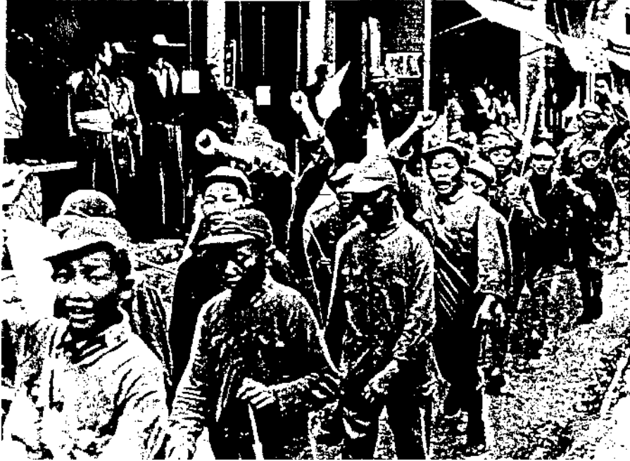
An early photograph of the Red Army (although they had very poor equipment they had strong discipline).