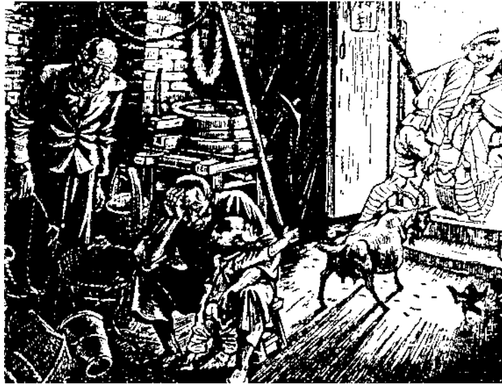
A Chinese woodcut showing Nationalist tax collectors taking the last food and animals from a starving family.