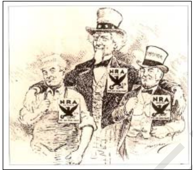
An American cartoon published in 1933.