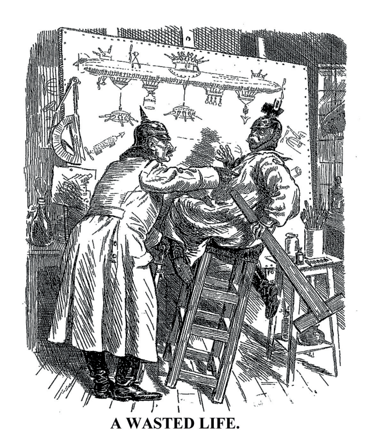
KAISER (to Count ZEPPELIN). "TELL ME, COUNT, WHY DIDN'T YOU INVENT SOMETHING USEFUL, LIKE THE 'TANKS'?"

A cartoon published in a British magazine, September 1916.