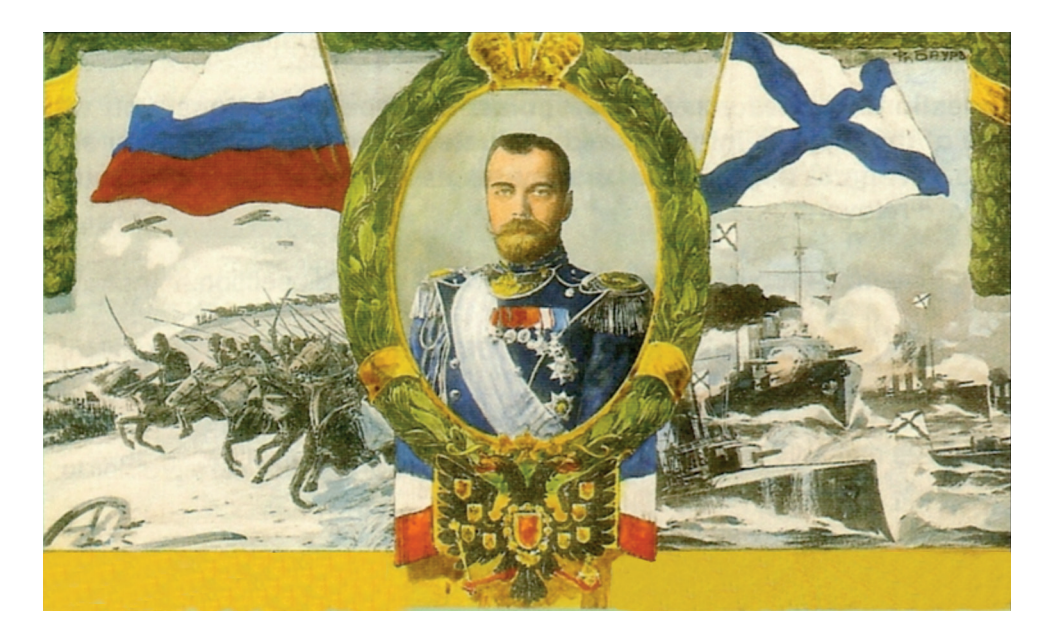
A Russian postcard showing the Tsar, issued in 1916.