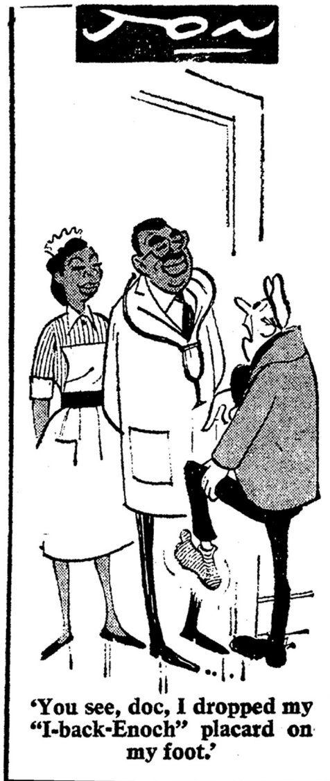
A cartoon published in a British newspaper in 1968.