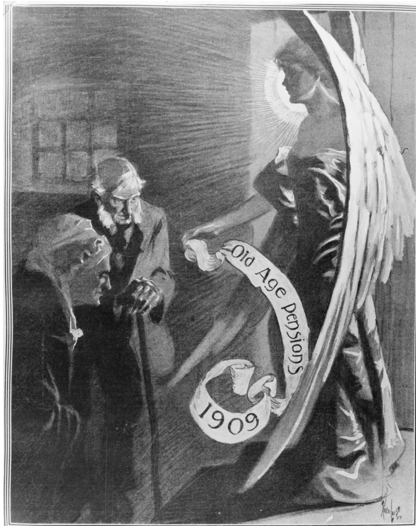
A cartoon published in Britain in January 1909.