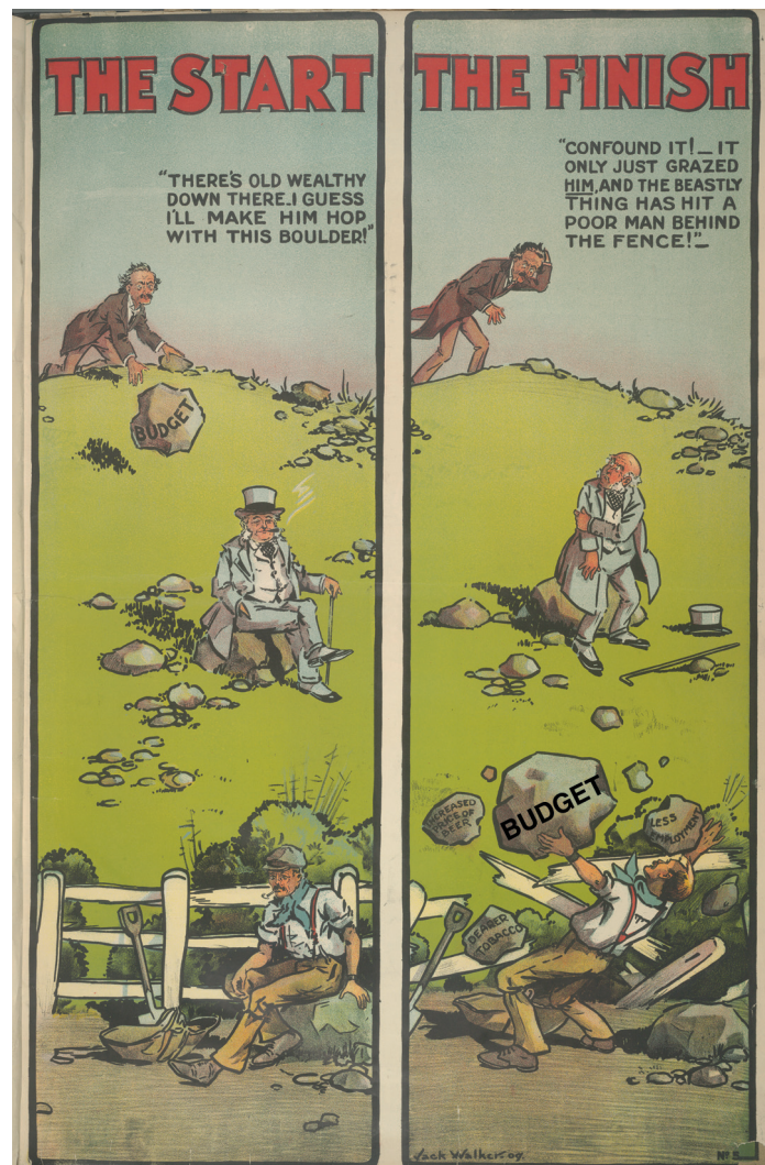
A poster published in 1909. The man at the top of the hill is David Lloyd George.