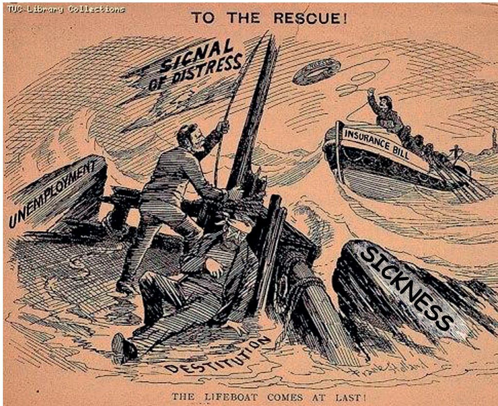
A poster about the introduction of National Insurance published by the Liberal Party in 1911. The word on the lifebelt is 'Benefits'.