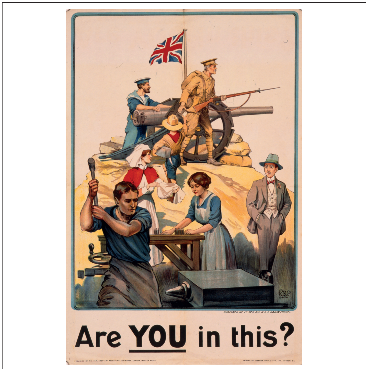
A poster published by the British government in 1915.