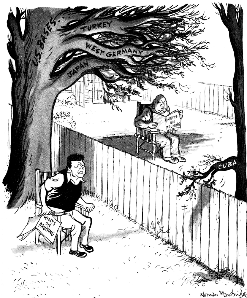
OVER THE GARDEN WALL

A cartoon published in Britain, 17th October 1962. President Kennedy is on the left. Khrushchev is on the right. Pruning means cutting back.