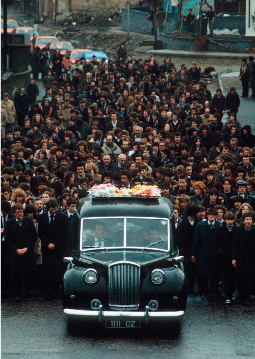
A photograph of the funeral of IRA member Bobby Sands, published in a Belfast newspaper, May 1981.