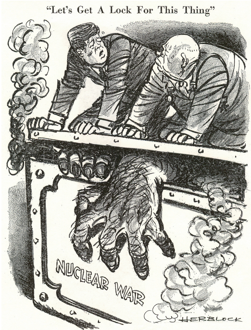
An American cartoon published on 1st November 1962. The people shown are Kennedy and Khrushchev.