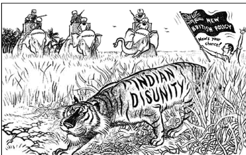
A British cartoon published in 1942. The figure on the right is Sir Stafford Cripps.