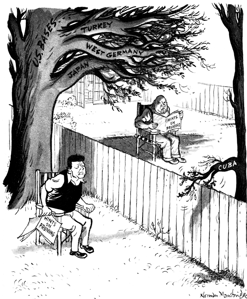
OVER THE GARDEN WALL

A cartoon published in Britain, 17th October 1962. President Kennedy is on the left. Khrushchev is on the right. Pruning means cutting back.