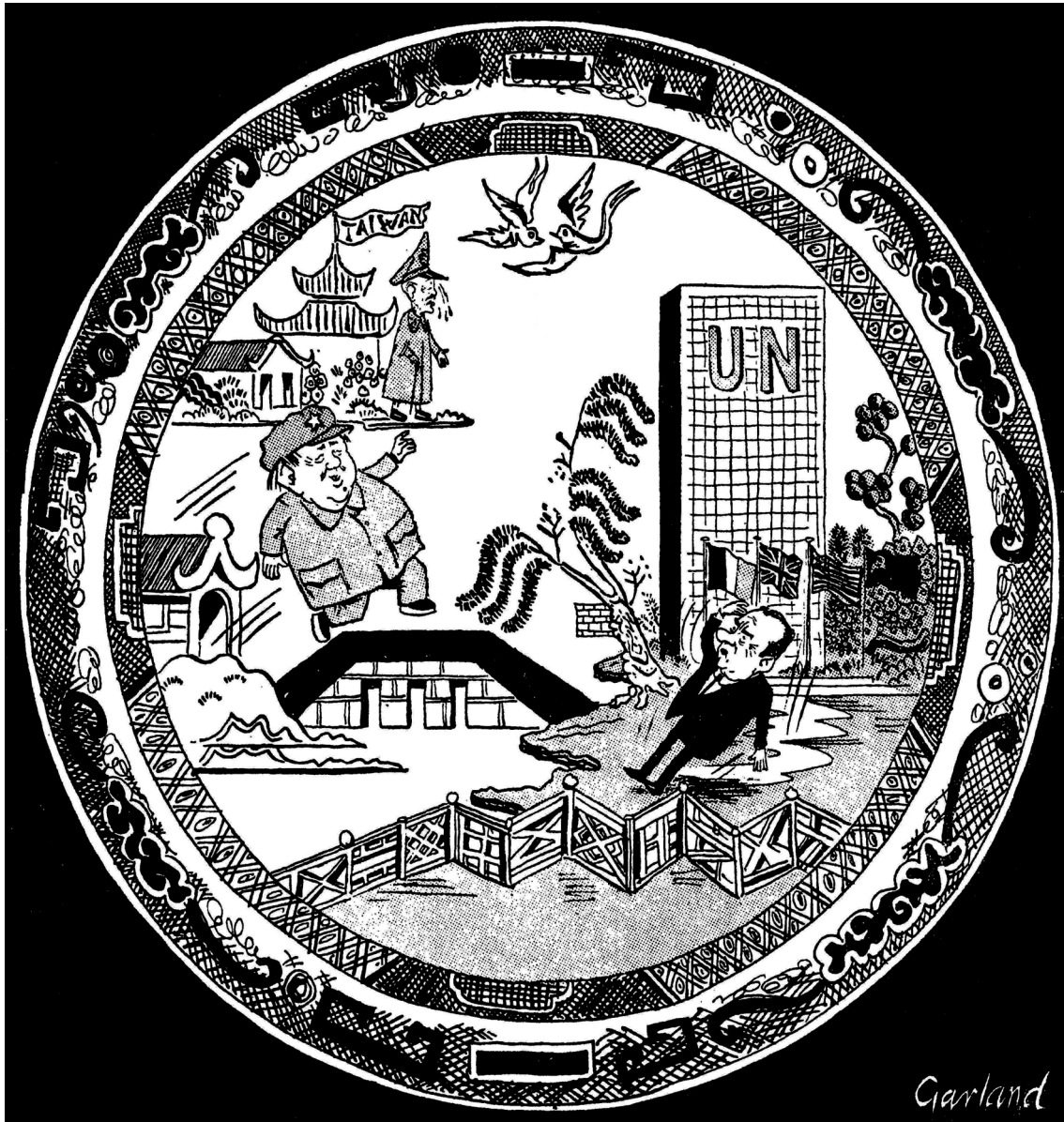
A British cartoon published in October 1971. From top to bottom the figures are Chiang Kai-shek, Mao Zedong and President Nixon.