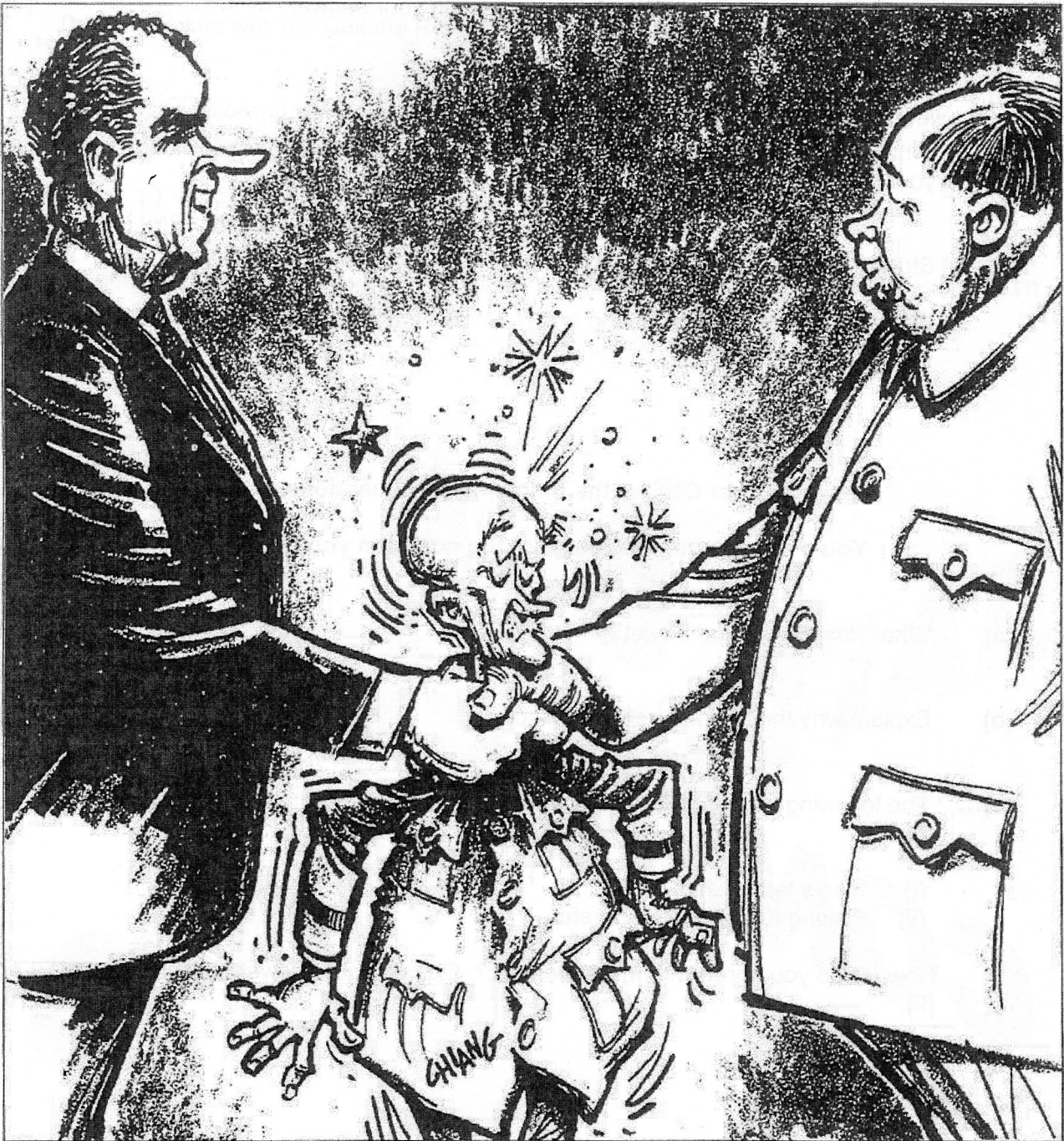
A cartoon from an American newspaper published in 1972. From left to right the figures are President Nixon, Chiang Kai-shek and Mao Zedong.