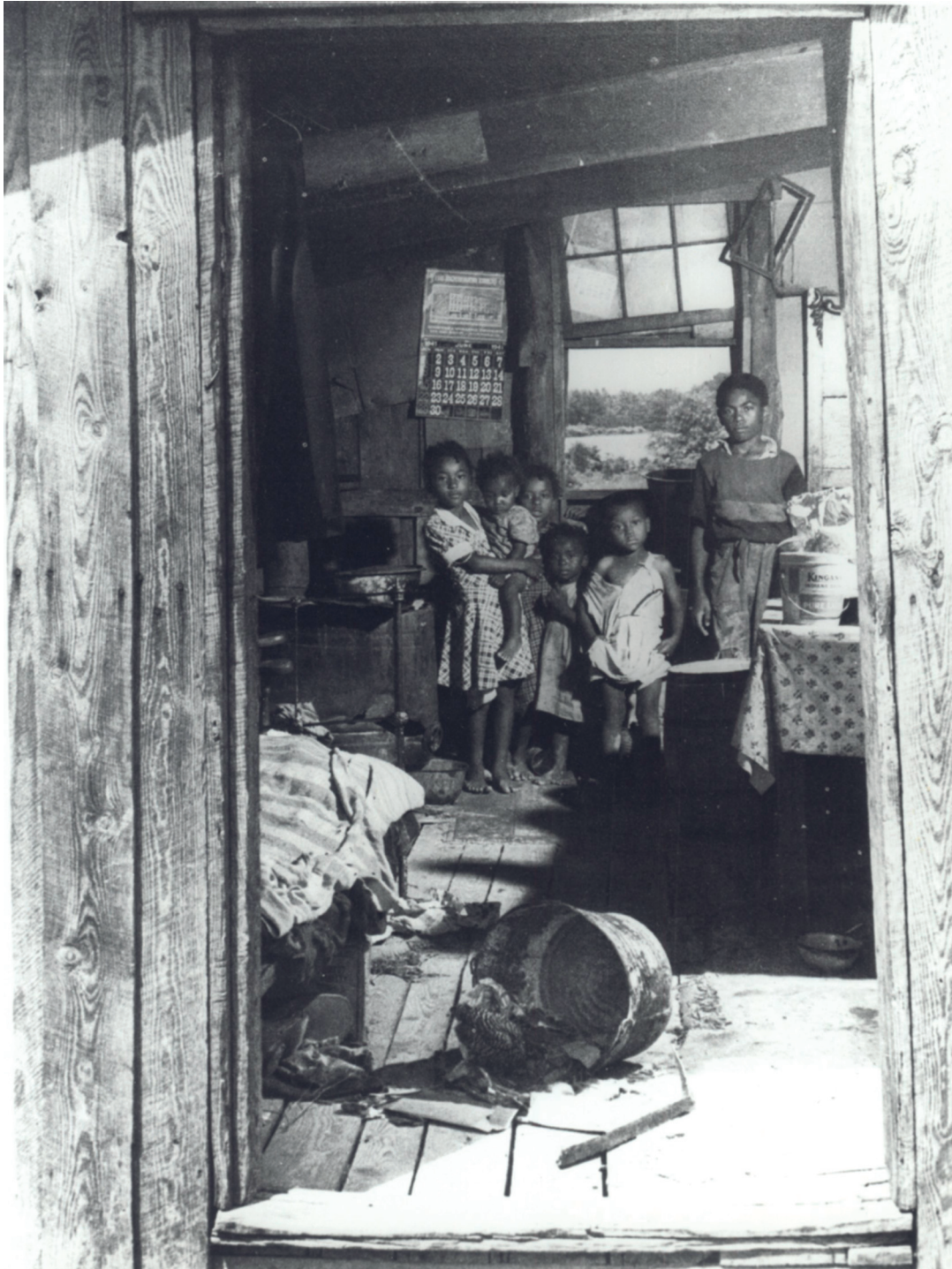
A photograph of a black family and their home in Virginia, in the 1920s.