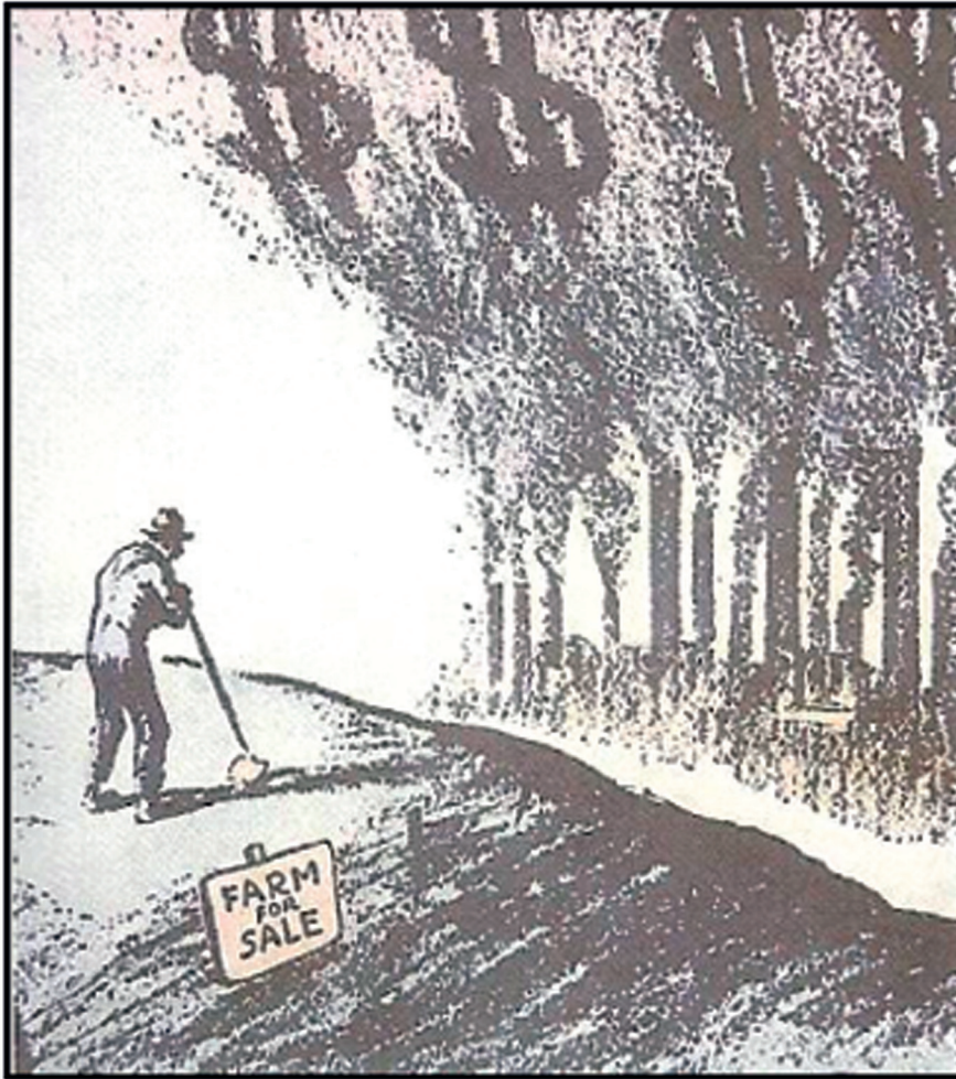
A cartoon published in America in the 1920s.