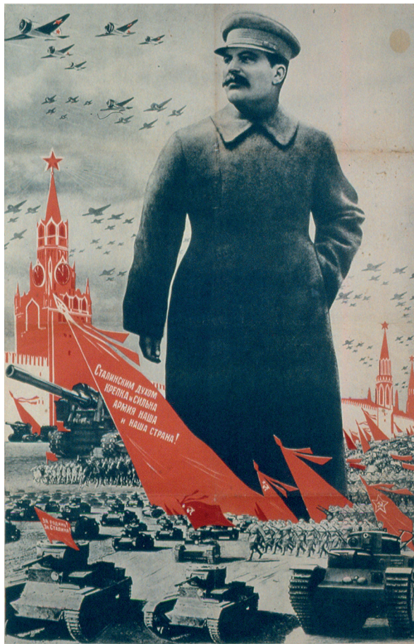
A Soviet poster from the 1930s.