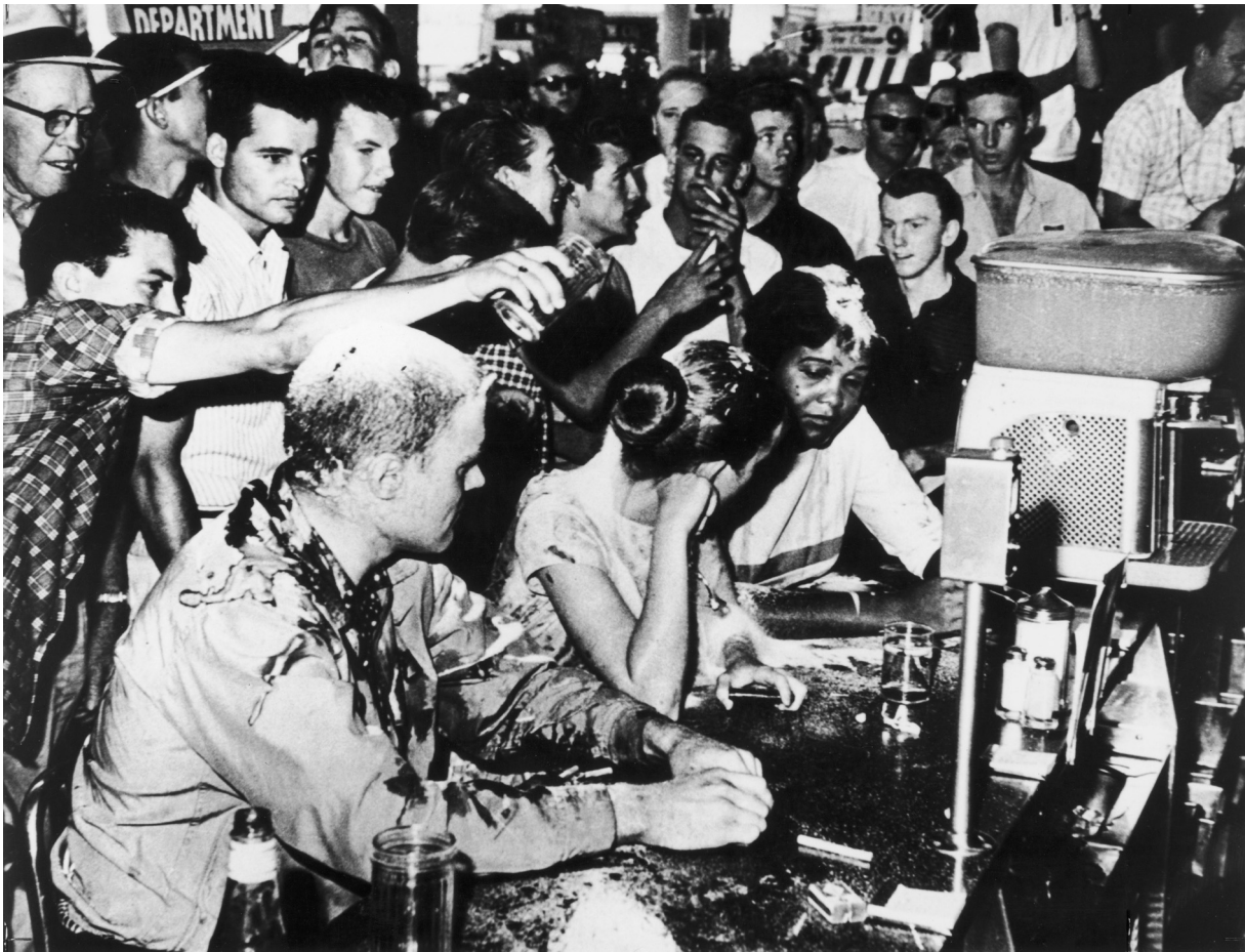
A photograph taken in a restaurant in Jackson, Mississippi, June 1963.