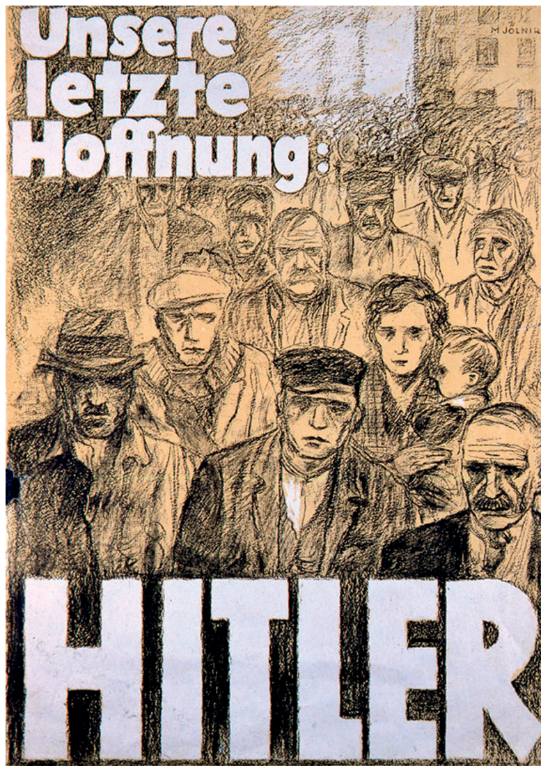
A poster published in Germany in 1932. It says, 'Our last hope: Hitler'.