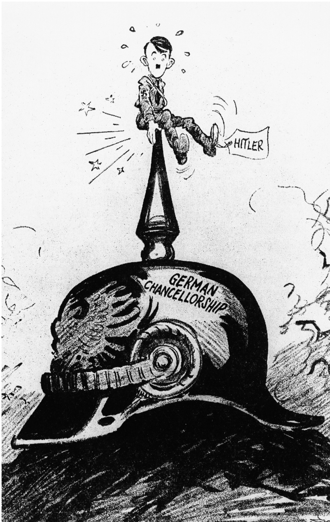
A cartoon entitled 'Not the most comfortable seat.' It was published in America in 1933.