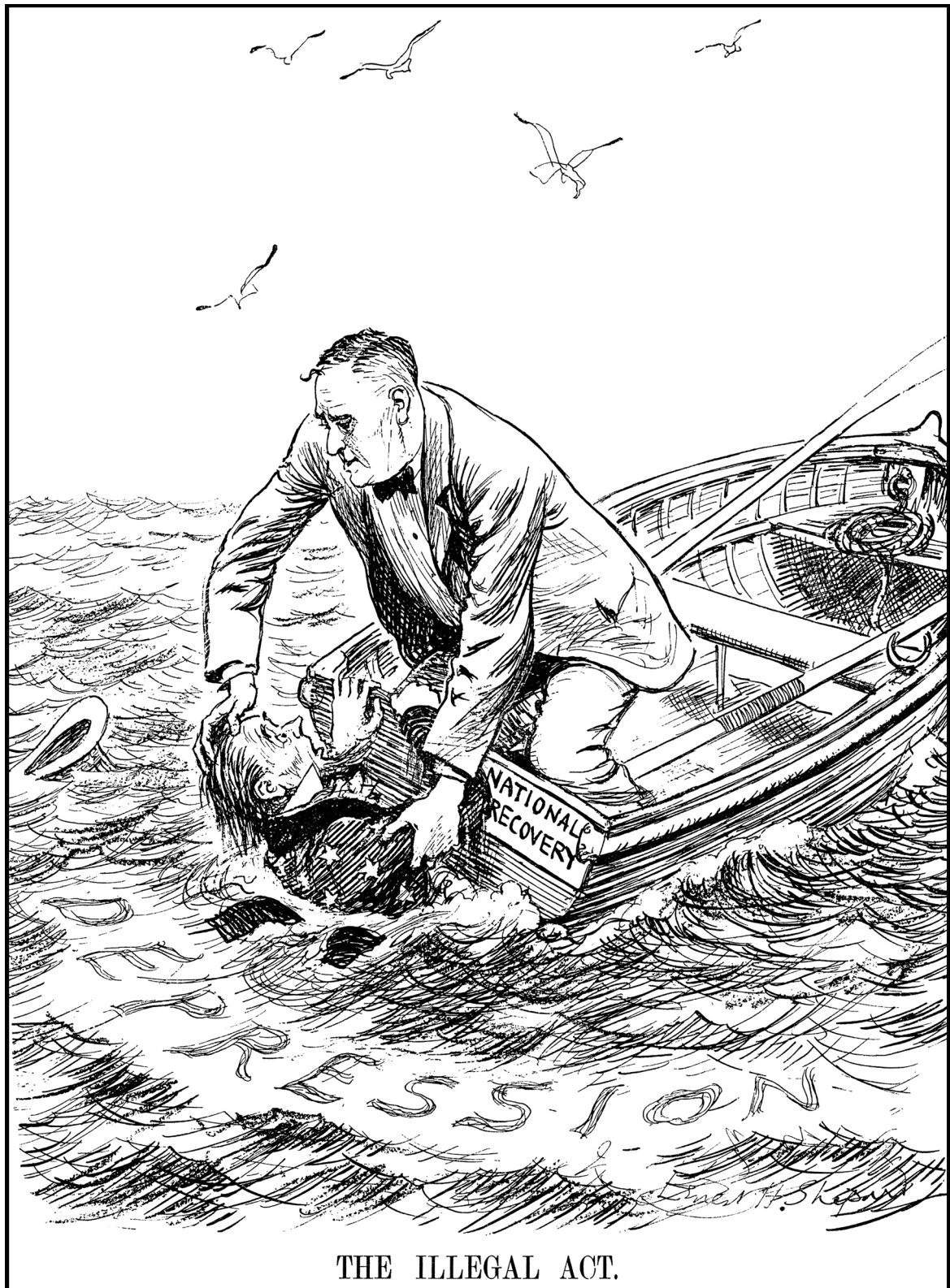
THE ILLEGAL ACT.