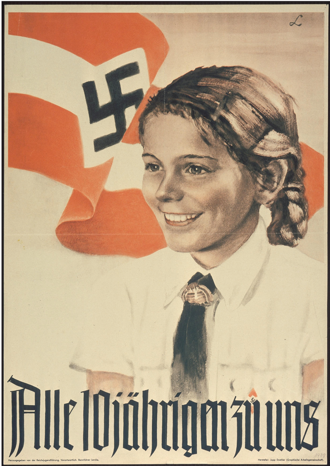
A poster published in Germany by the Nazis in the mid-1930s. It says, 'Every ten-year-old to us'. On the poster it shows a smiling blonde-haired girl wearing a uniform. Behind her, there is a flag with a swastika.