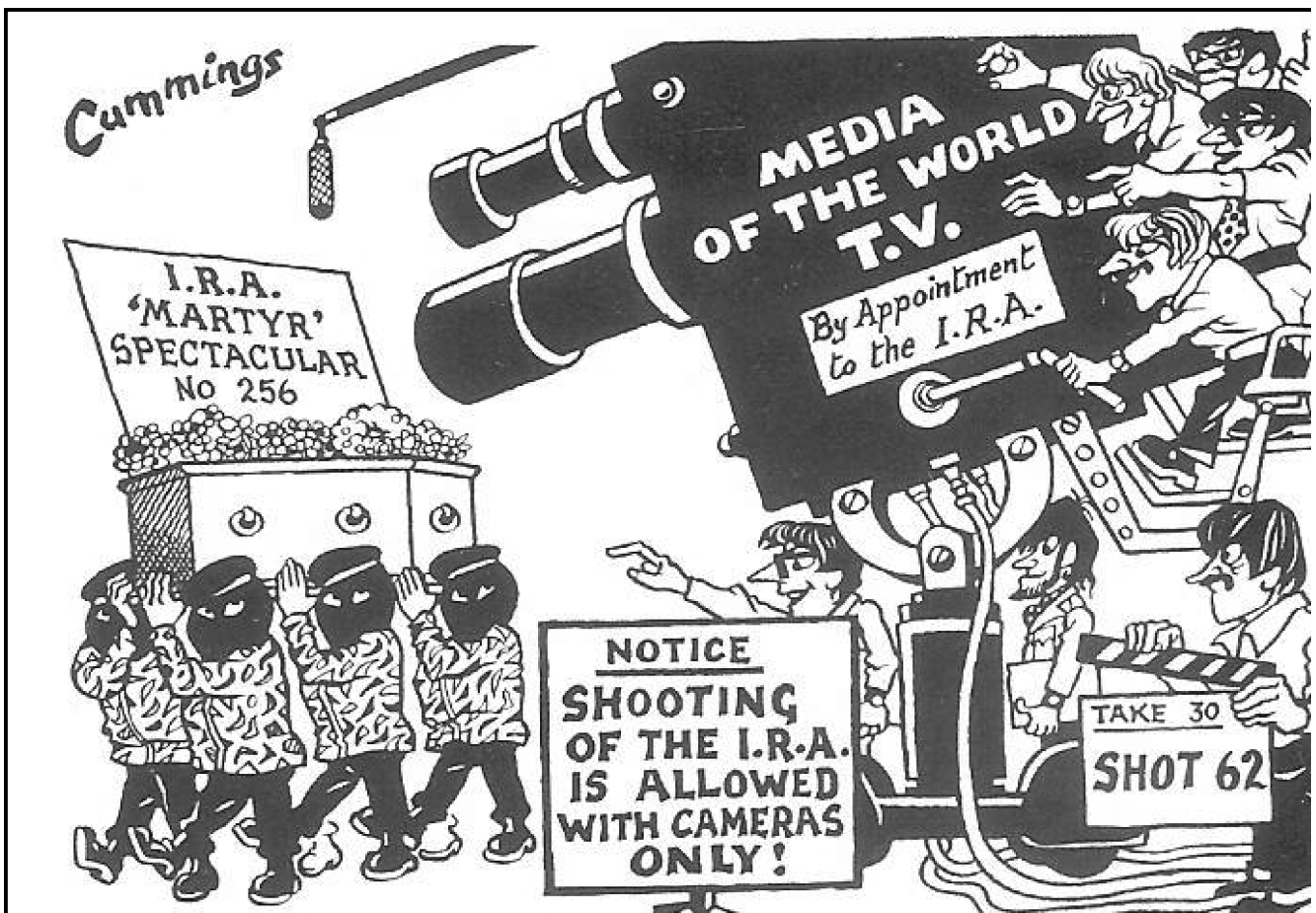
A cartoon published in an English newspaper, 17 May 1981. It is commenting on the IRA hunger strike.