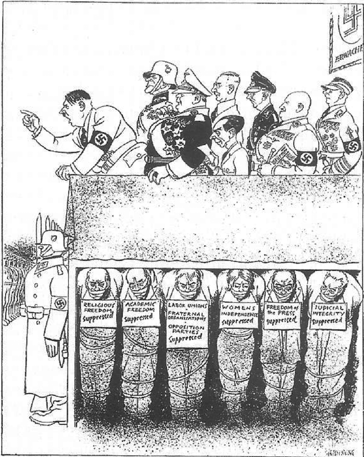
"In these three years I have restored honor and freedom to the German people!"