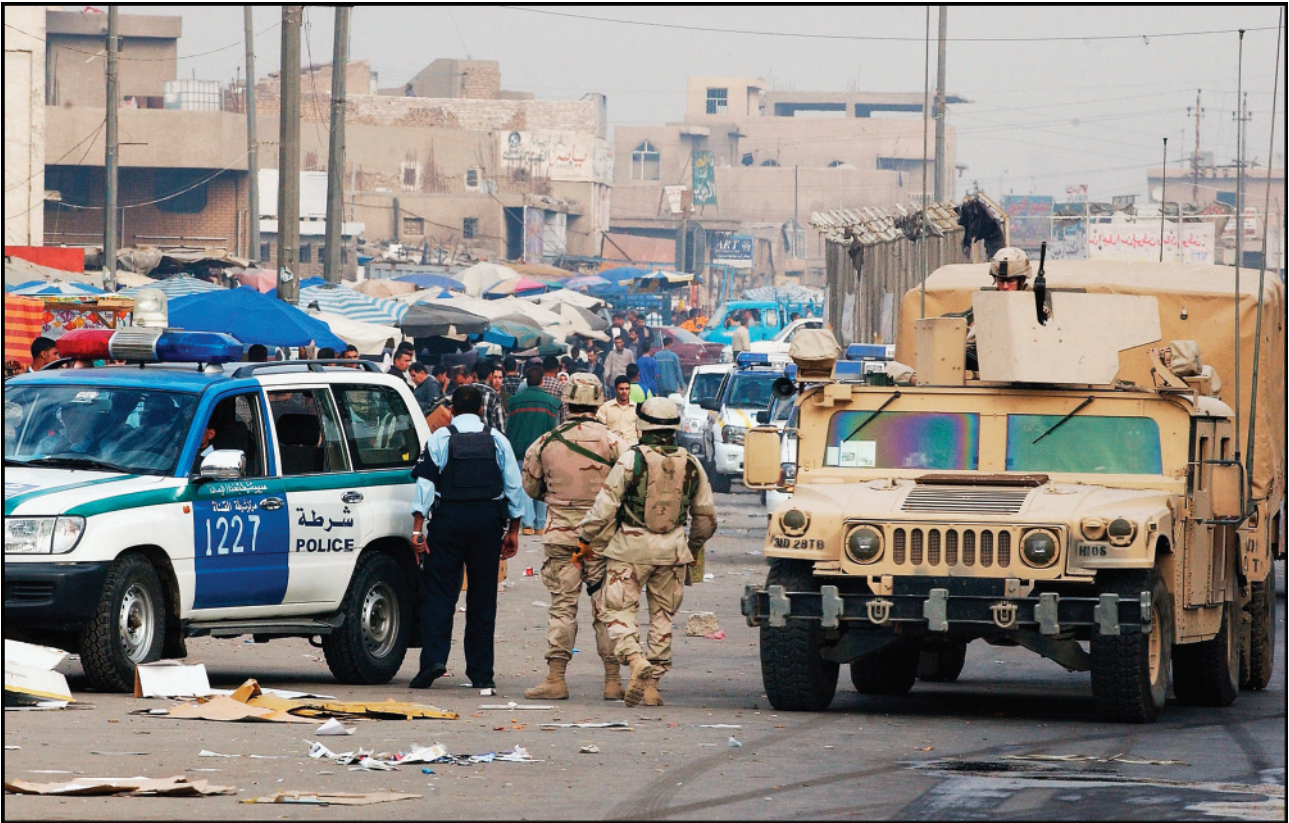
A photograph of Iraqi policemen and US soldiers dealing with the aftermath of a bomb explosion in December 2005. The explosion was in a popular market area in central Baghdad. Two Iraqi civilians were killed.