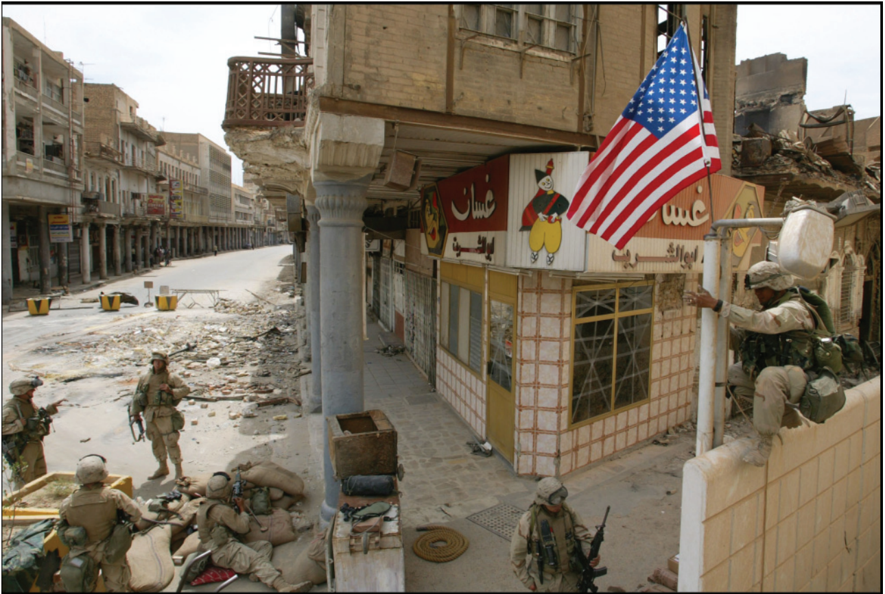
An American photograph taken in Baghdad in April 2003.