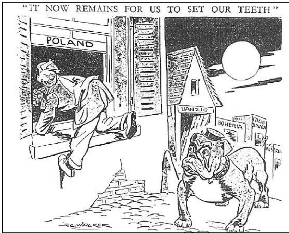
A cartoon published in Britain in 1939. The bulldog represents Britain. It is growling at the German burglar.