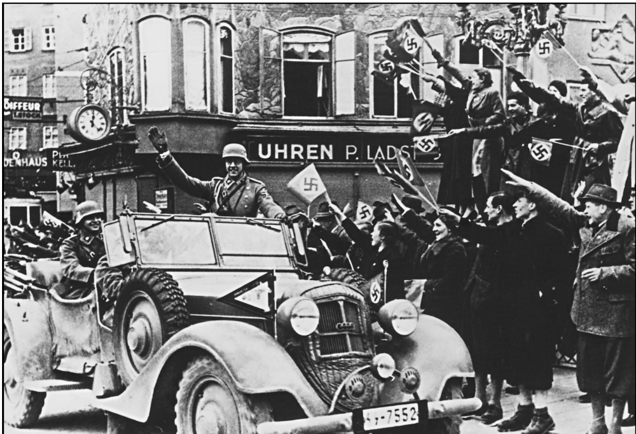
A photograph of the German army entering Austria in March 1938.