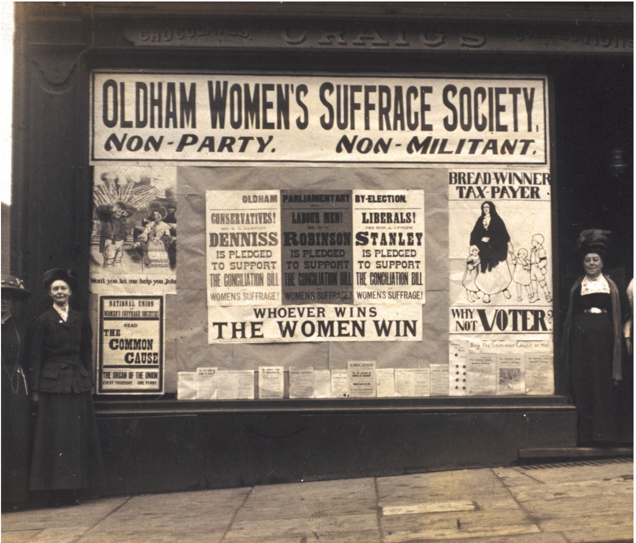
A photograph of the offices of the Oldham branch of the NUWSS during a by-election in Oldham in 1911.