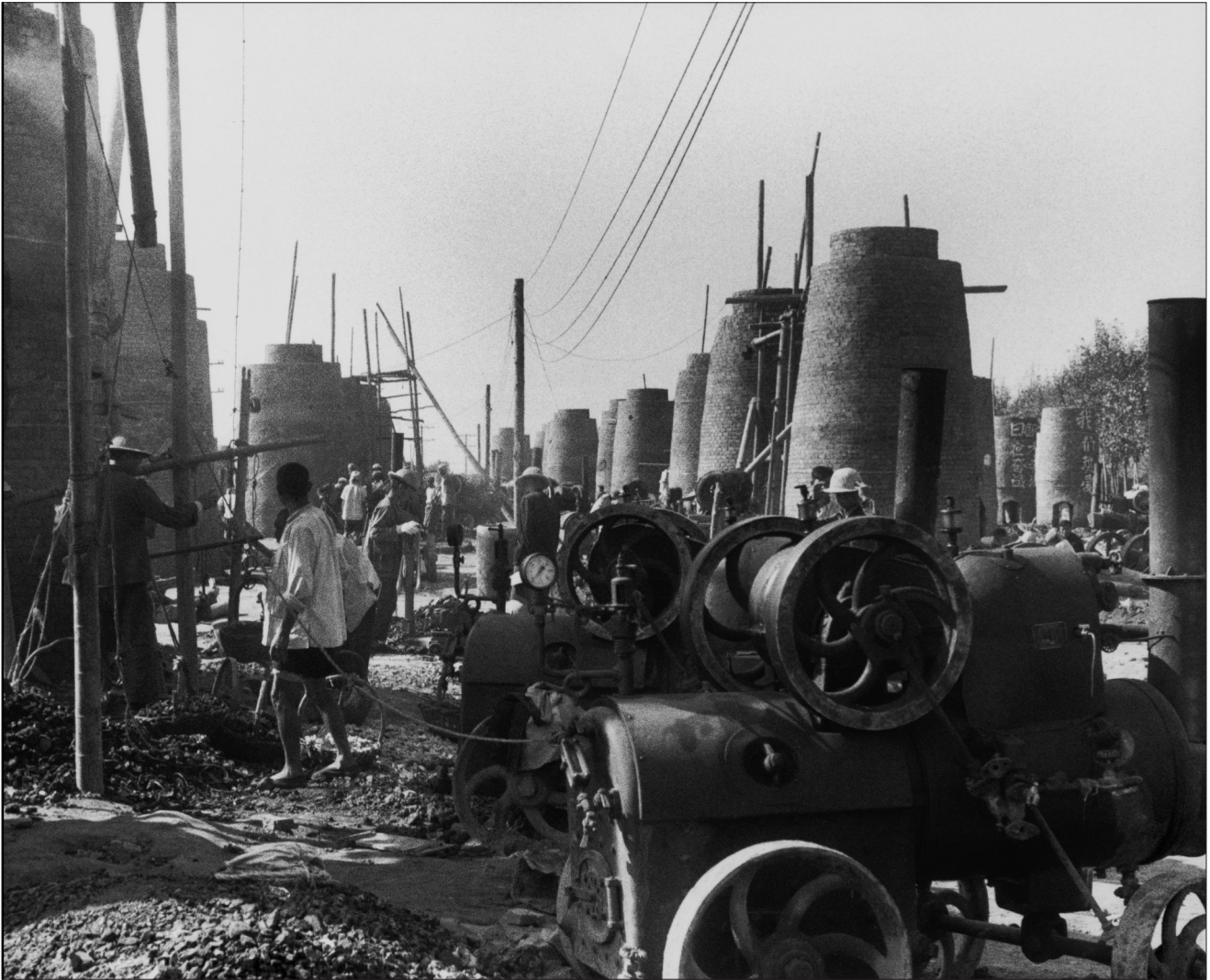
A photograph of 'Backyard' steel furnaces built during the Great Leap Forward.