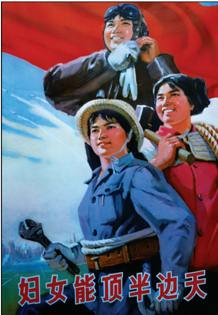
A Chinese government poster. The caption repeats Mao's slogan that 'women hold up half the sky'. It was published at the time of the Five Year Plan.