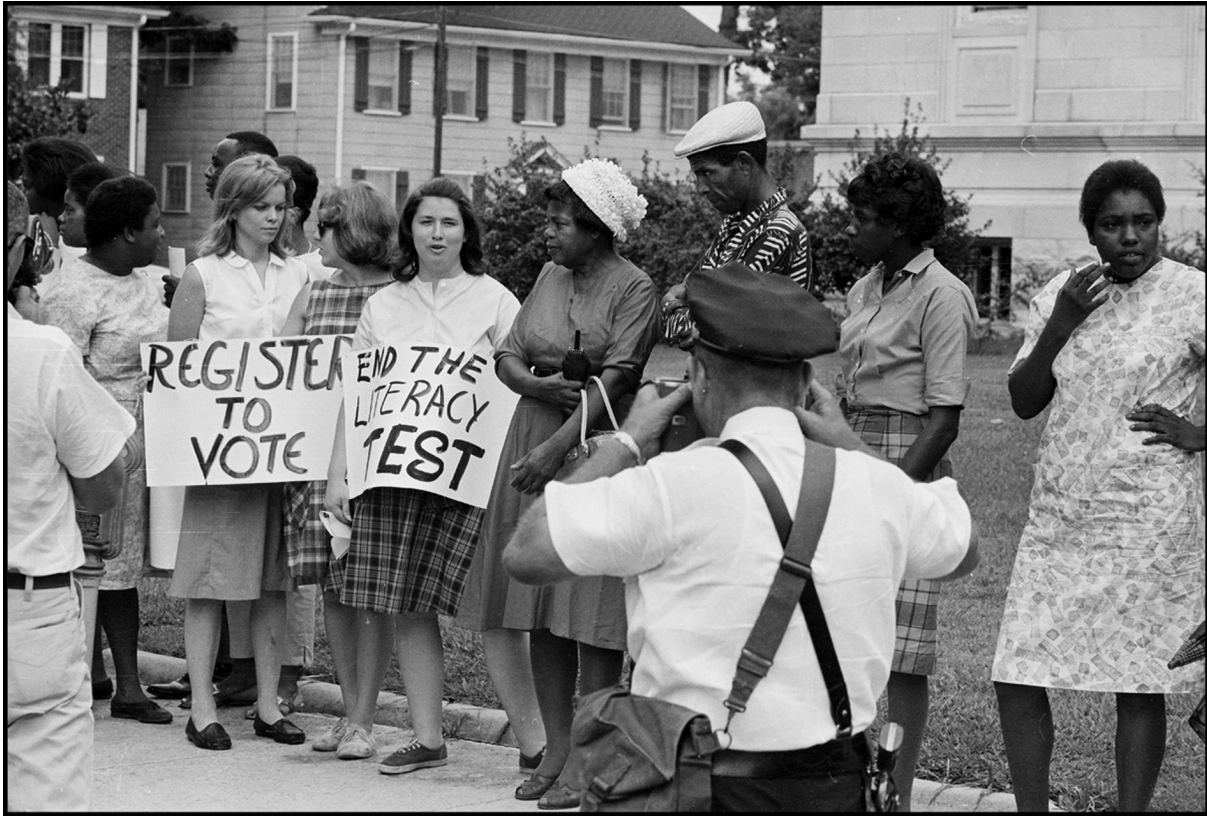
A photograph of student protesters being photographed by a policeman on Freedom Day, 1964.