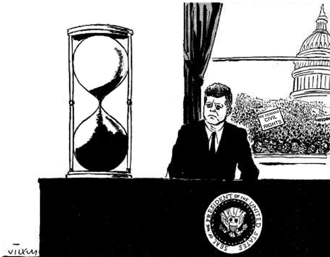
A British cartoon published in August 1963.