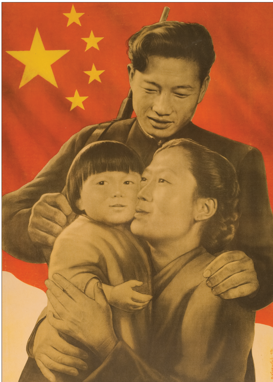
A poster published in Russia in 1950. The caption reads, 'Glory to the great Chinese people who have gained freedom, independence and happiness'.